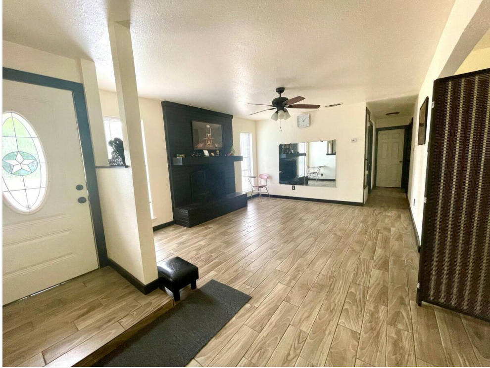
2905 Entry Hall view