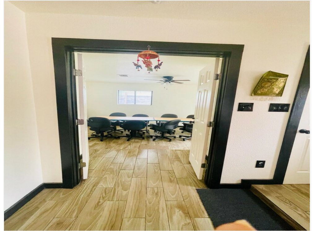
2905 Conference Entry