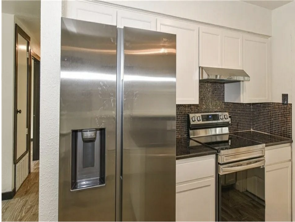
2905 BR appliance