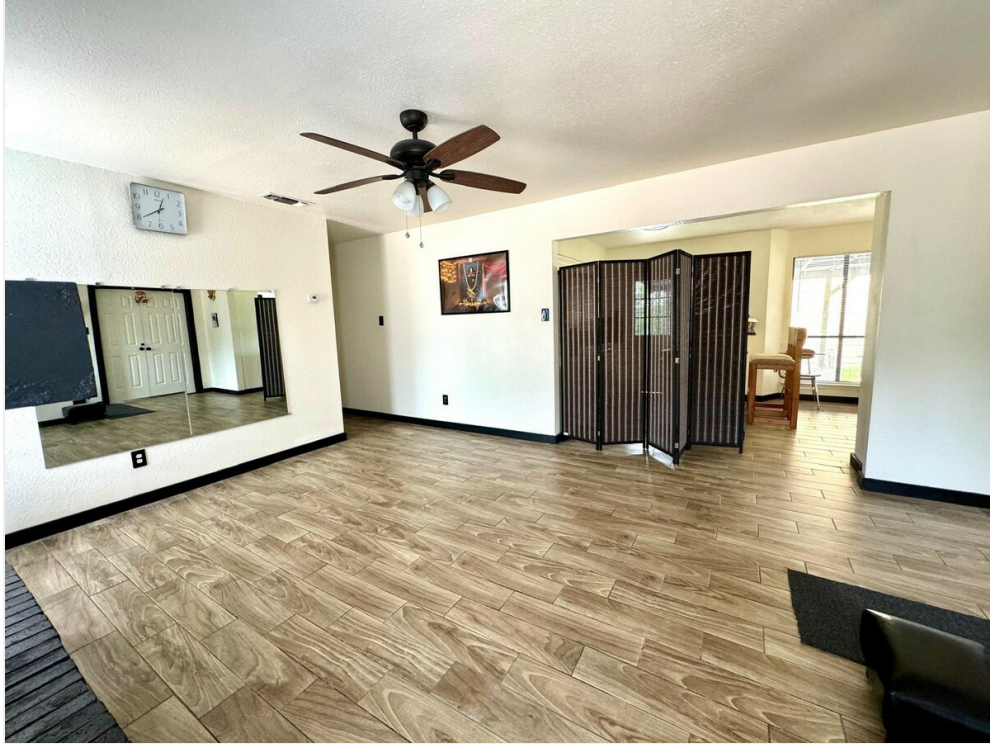
2905 Reception Hall