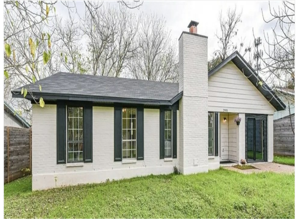
2905 BR front View BLD A