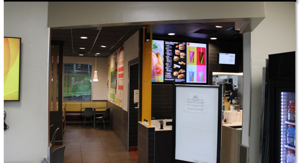
Entrance through Convenience Store

Leasing Information 770-338-2620 leasing@majorsmgmt.com