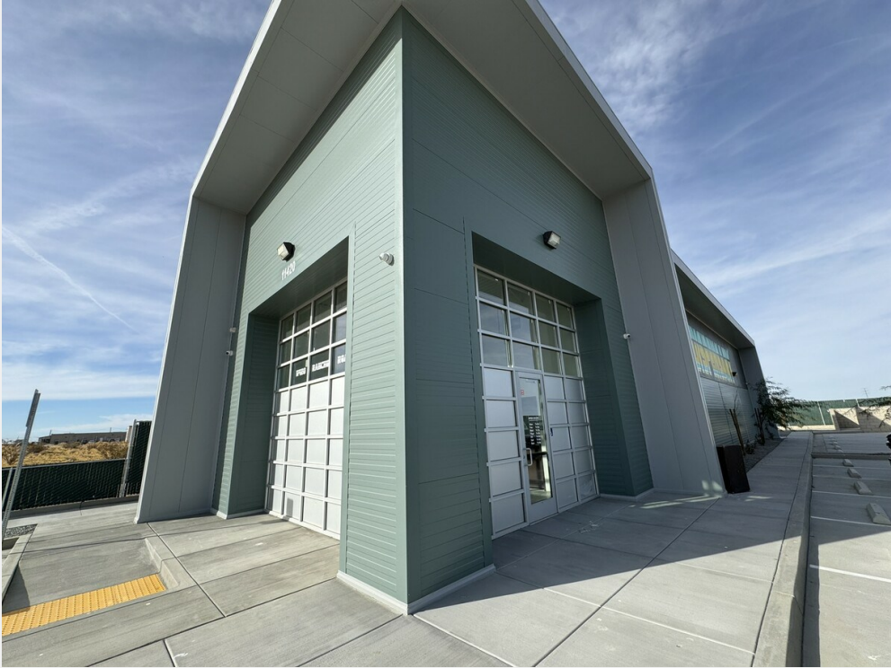
Entrance Secure and Hardened