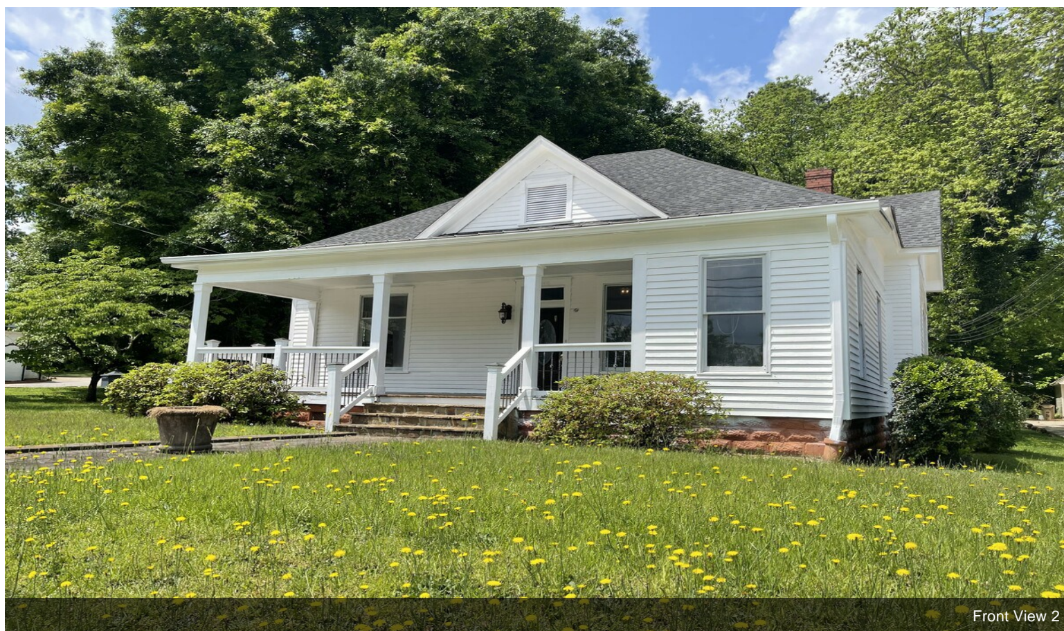
Front View 2