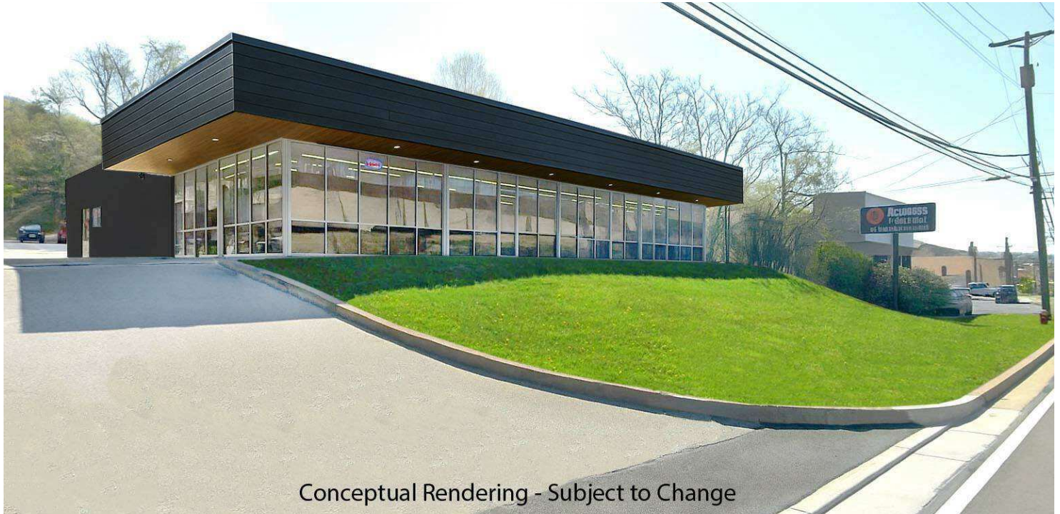
Conceptual Rendering - Subject to Change