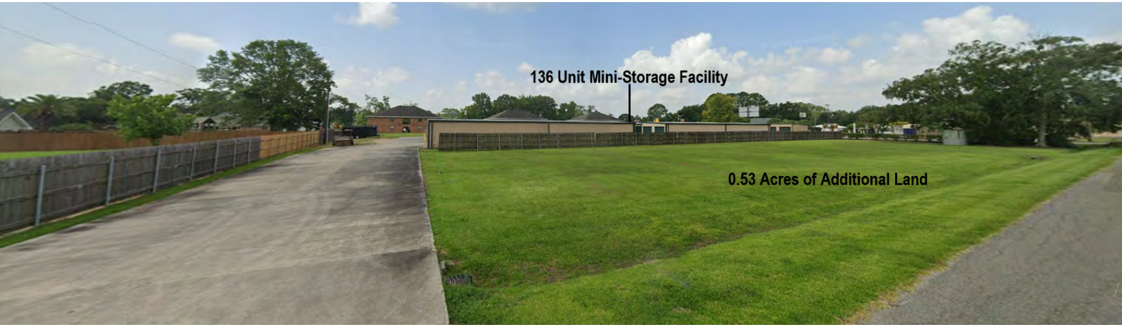
136 Unit Mini-Storage Facility