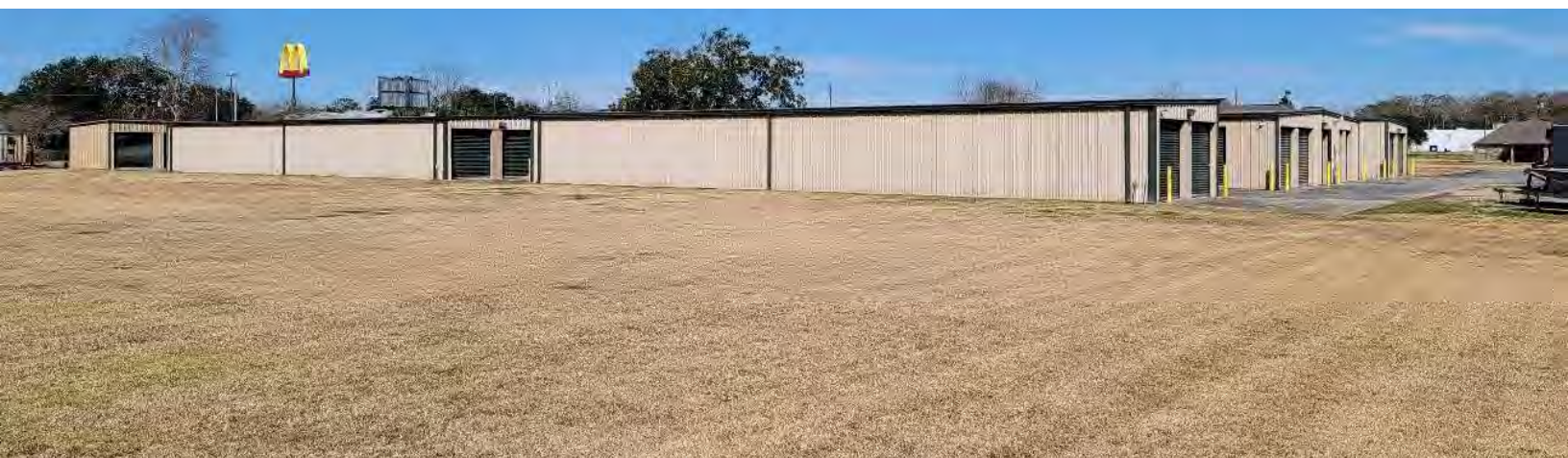
0.53 Acres of Additional Land