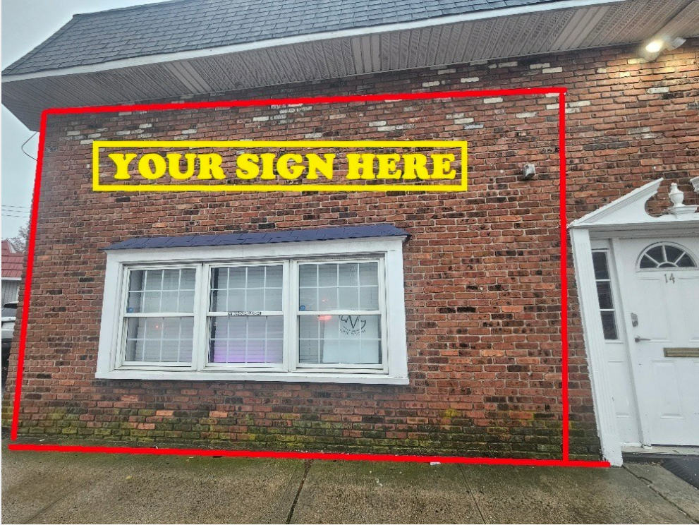
14 Tulip Office-Warehouse Showroom Studio LEASE