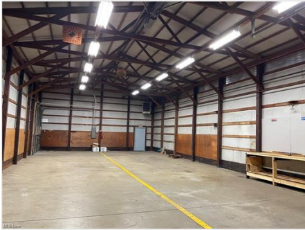
View of garage