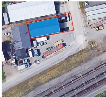
View of property location with property boundaries highlighted

Information is Believed To Be Accurate But Not Guaranteed