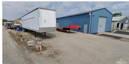
View of outdoor structure