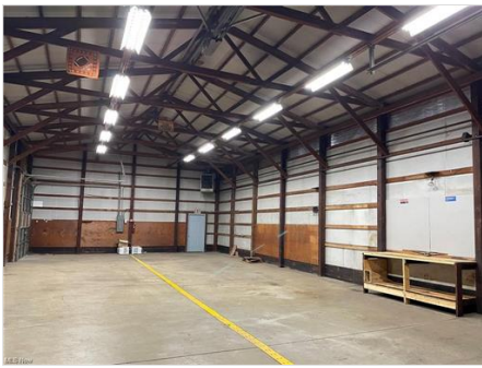
View of garage