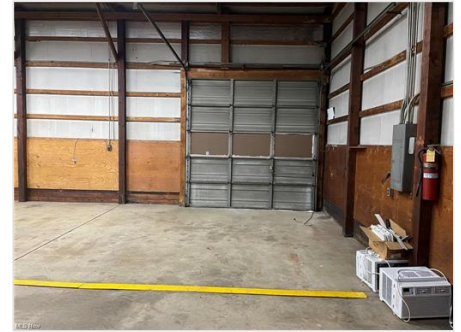
Garage with electric panel