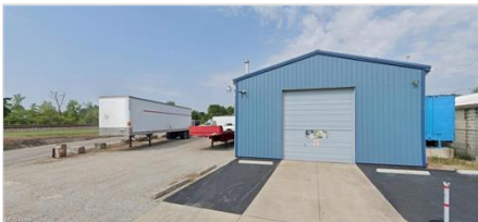
View of garage

Warehouse SqFt: 0 Bsmt: Yr: 1999 Acres: 0.12 $249,000