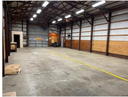
View of garage