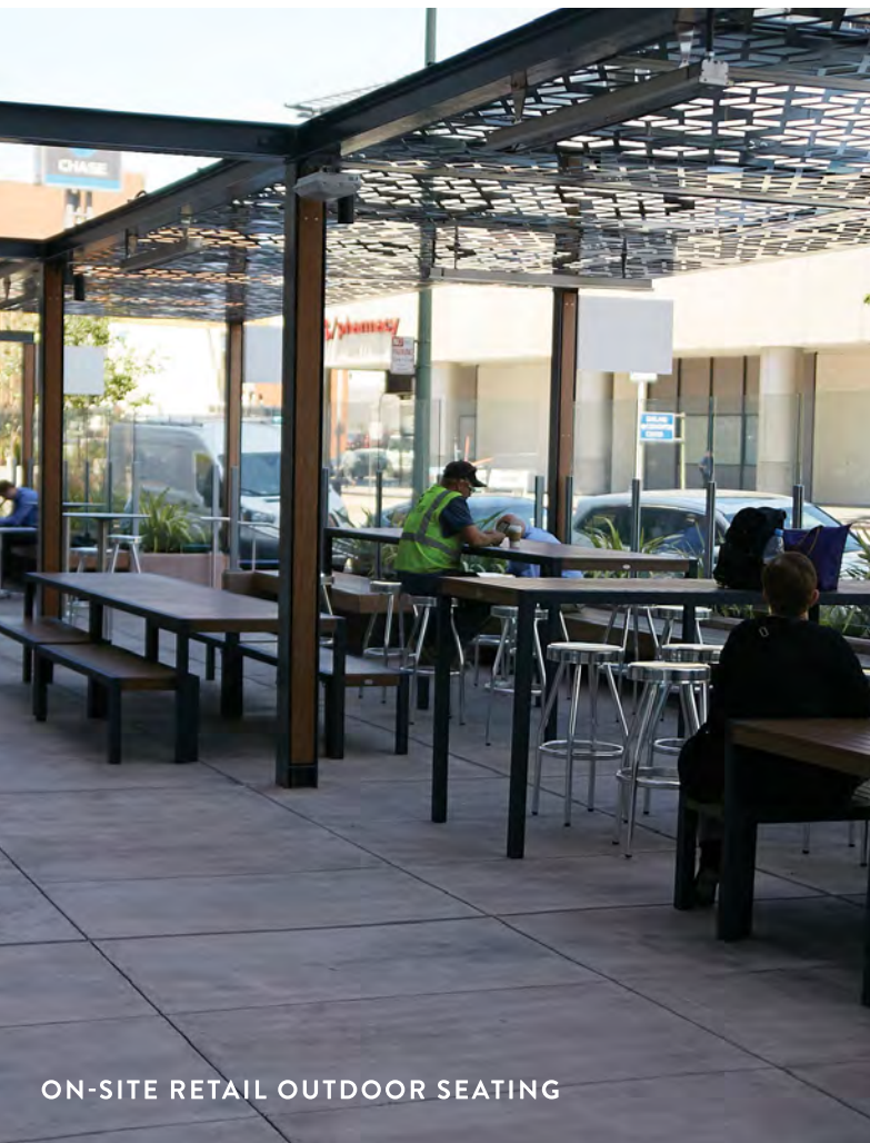
ON-SITE RETAIL OUTDOOR SEATING