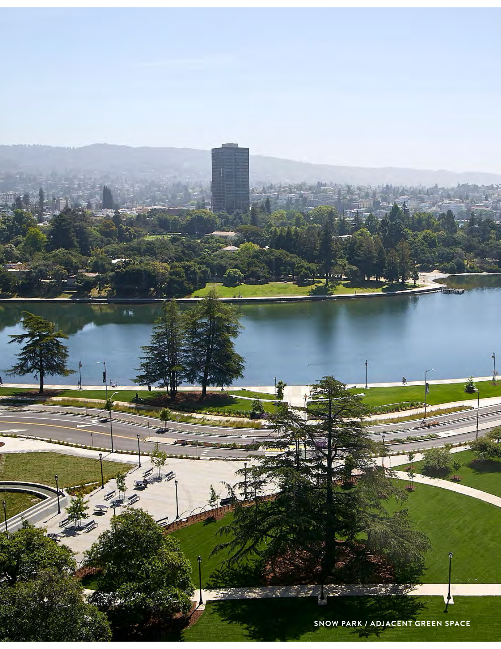
SNOW PARK / ADJACENT GREEN SPACE