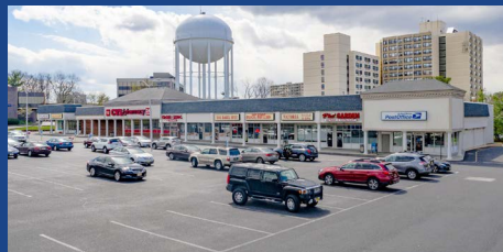
600 KINGS HIGHWAY NORTH