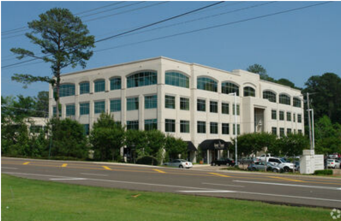
Highland Bluff Office Building