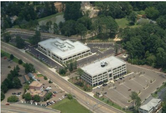
Highland Bluff Office Building