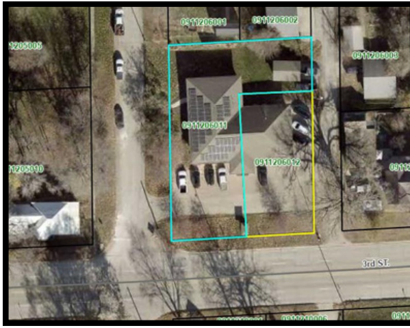
417 1st Avenue SE | Cedar Rapids, IA 52401 | www.skogmancommercial.com

Information received or derived from Skogman agents and or companies is provided without representation or warranty. Each party shall conduct their own due diligence for accuracy, condition, compliance or lack of, applicable suitability, and financial performance.