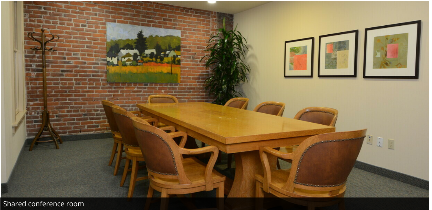
Shared conference room