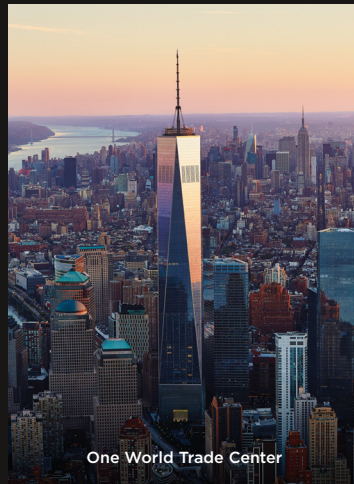
One World Trade Center