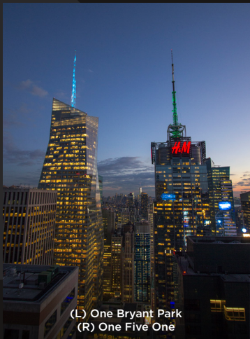
(L) One Bryant Park (R) One Five One

The Durst Organization owns and manages 13 million square feet of Class A office and retail space and over three million square feet of residential rental properties, with 3,400 apartments built and several thousand in the pipeline.