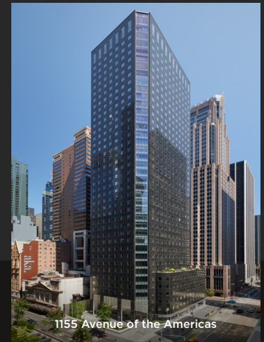
1155 Avenue of the Americas