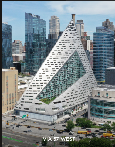
VIA 57 WEST