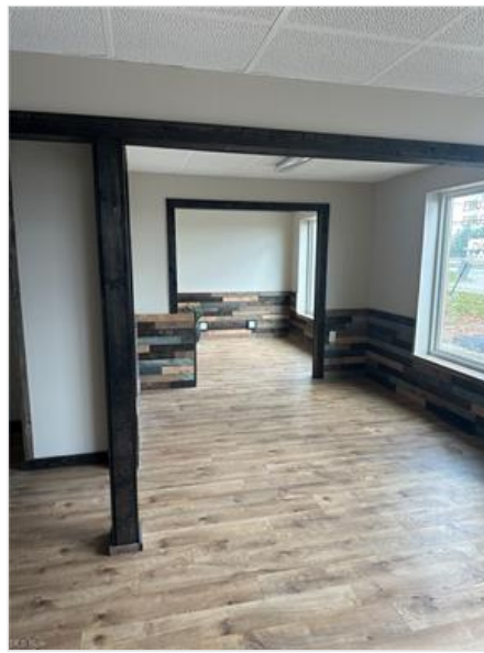
Empty room featuring light hardwood / wood-style flooring