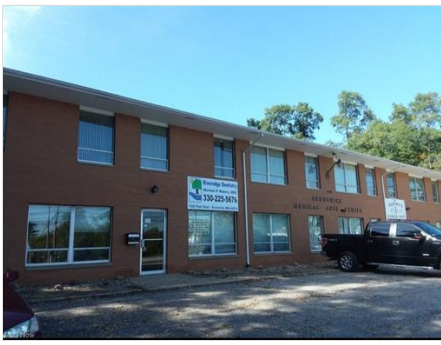
View of building exterior