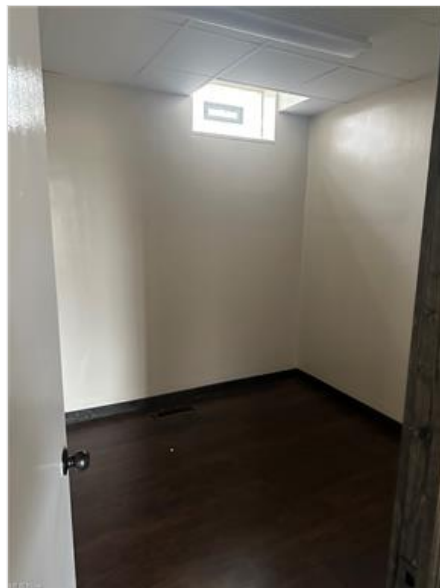
Empty room featuring dark hardwood / wood-style floors