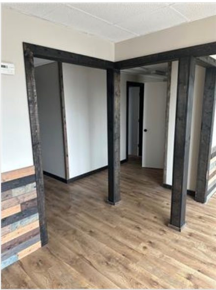
Basement with hardwood / wood-style flooring