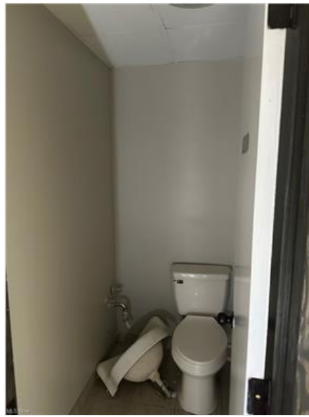
Bathroom featuring toilet and tile patterned floors