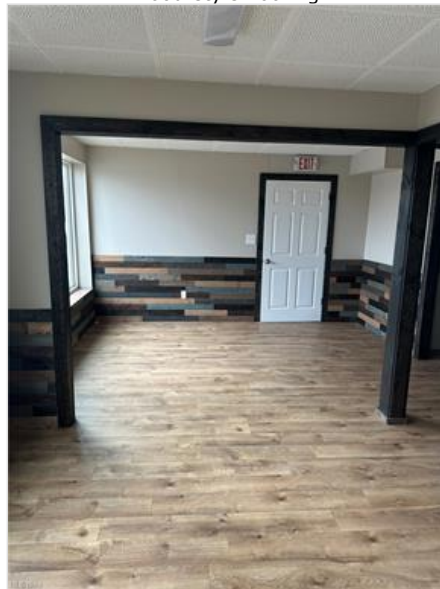
Empty room with a drop ceiling and light hardwood / wood-style flooring