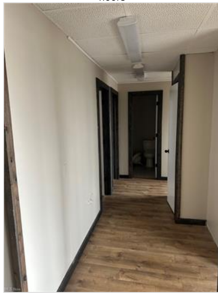
Hall with hardwood / wood-style flooring

Information is Believed To Be Accurate But Not Guaranteed