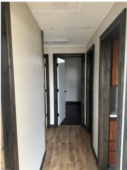
Hallway with wood-type flooring and a drop ceiling