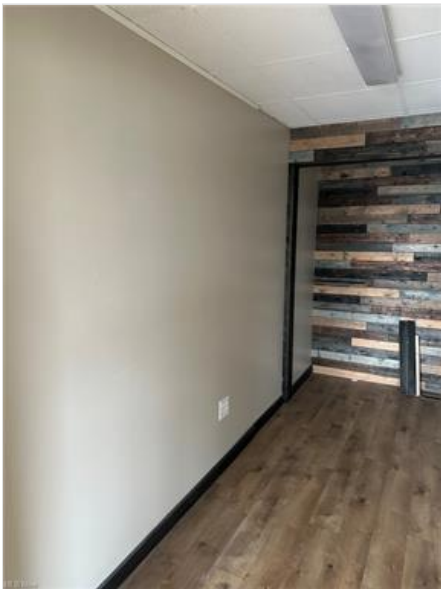
Empty room with a drop ceiling, wooden walls, and dark hardwood / wood-style floors