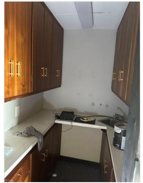
Kitchen featuring sink