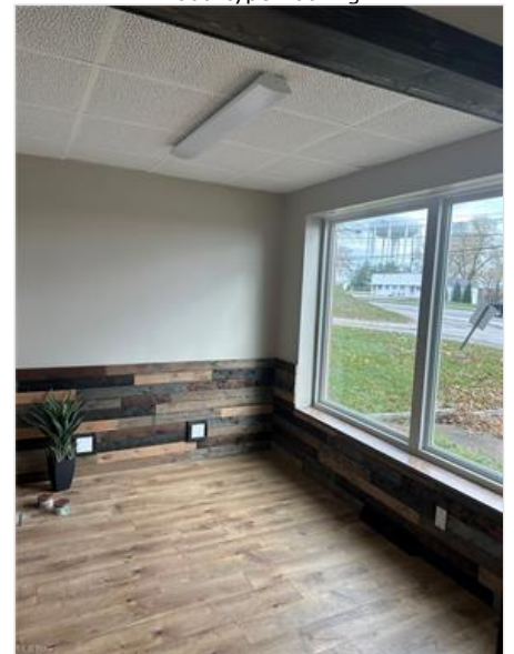
Empty room with wood walls, light wood-type flooring, a wealth of natural light, and a paneled ceiling