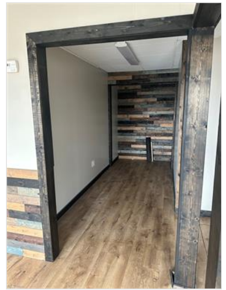
Empty room featuring wooden walls and wood-type flooring