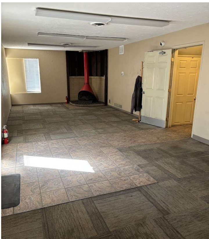
Entry / reception