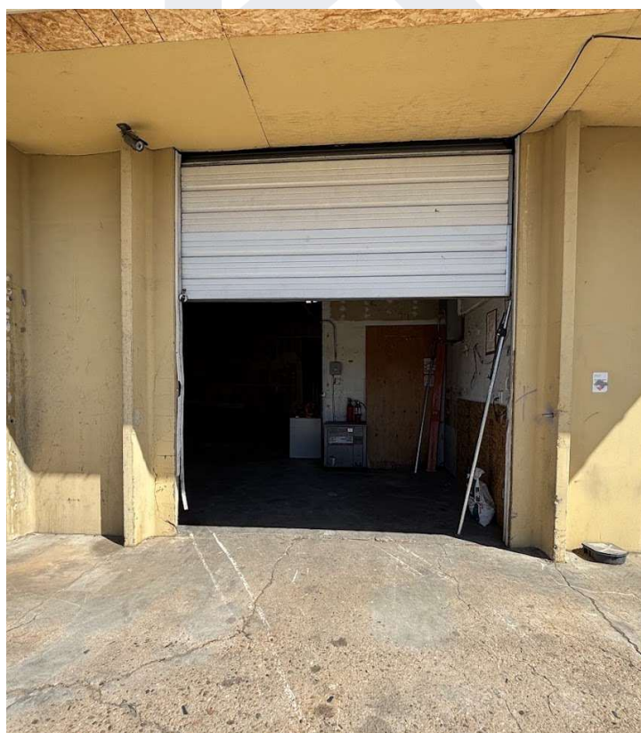
Dock door 3 / rear