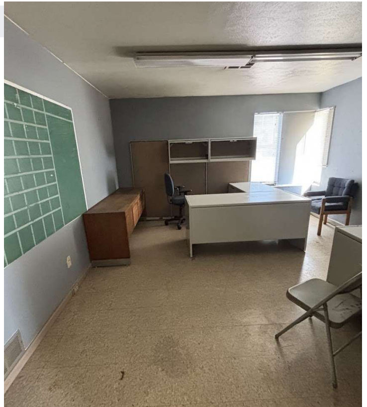
Lower level office