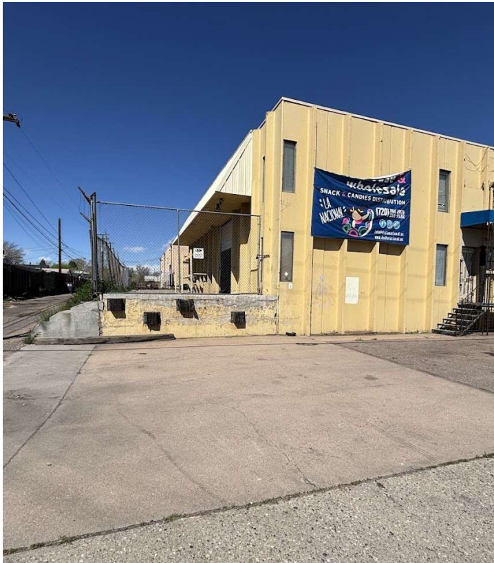
Unloading dock rear door