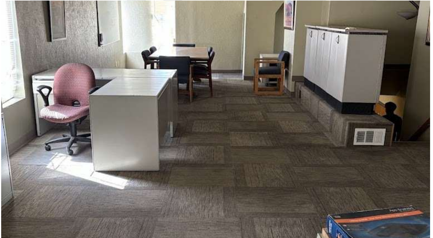
Upper level office