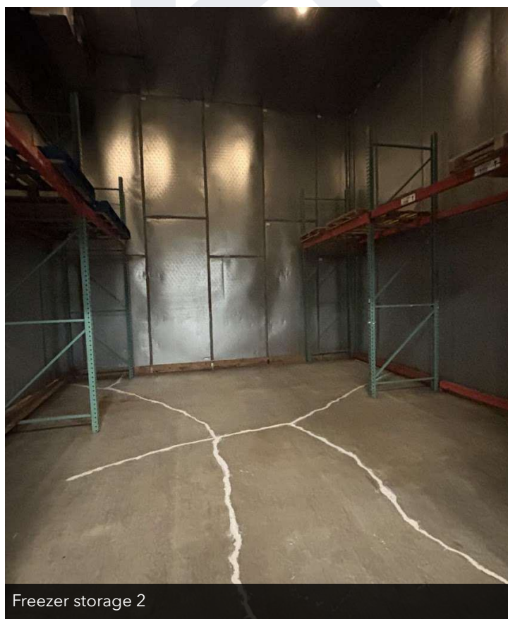
Freezer storage 2