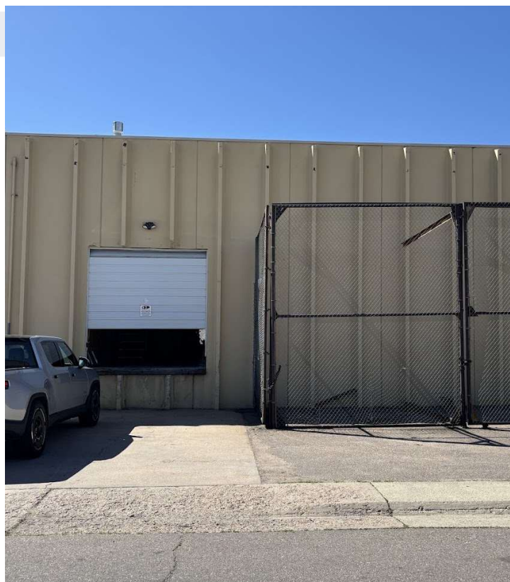
Dock door 1