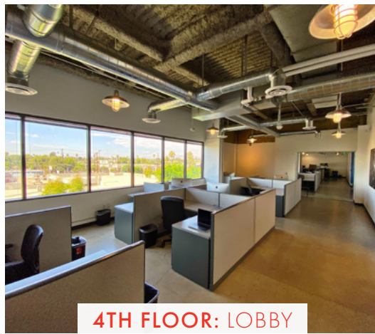
4TH FLOOR: LOBBY