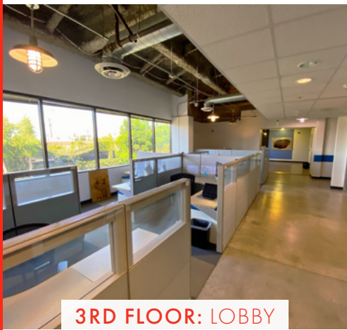
3RD FLOOR: LOBBY