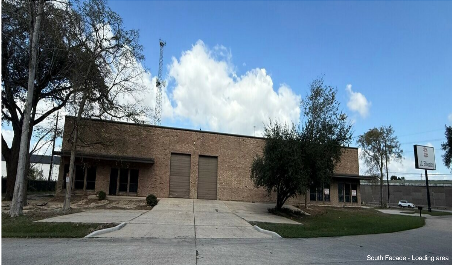
South Facade - Loading area