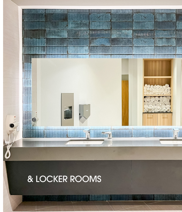
& LOCKER ROOMS