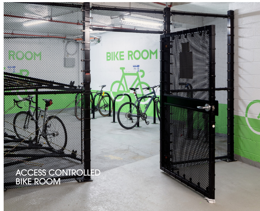
ACCESS CONTROLLED BIKE ROOM