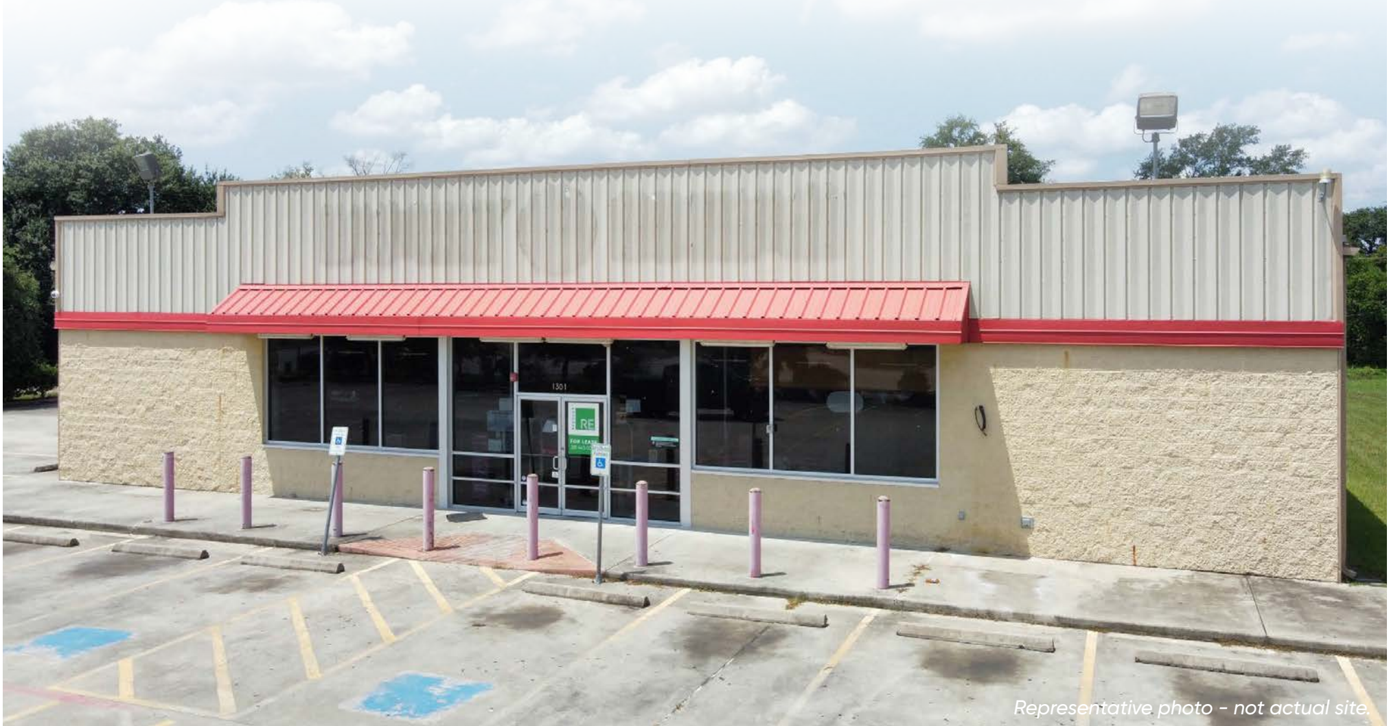
Representative photo - not actual site.

NW CORNER OF TEXAS STATE HIGHWAY 87 AND W SHOLARS AVE 1301 North 16th St, Orange, TX 77630