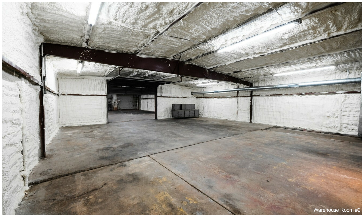
Warehouse Room #2