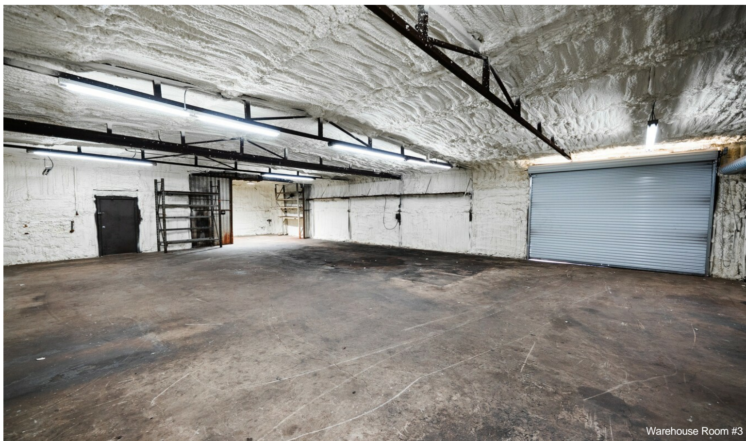
Warehouse Room #3