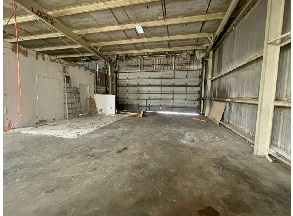
Double Dock for Optimum Loading and Unloading