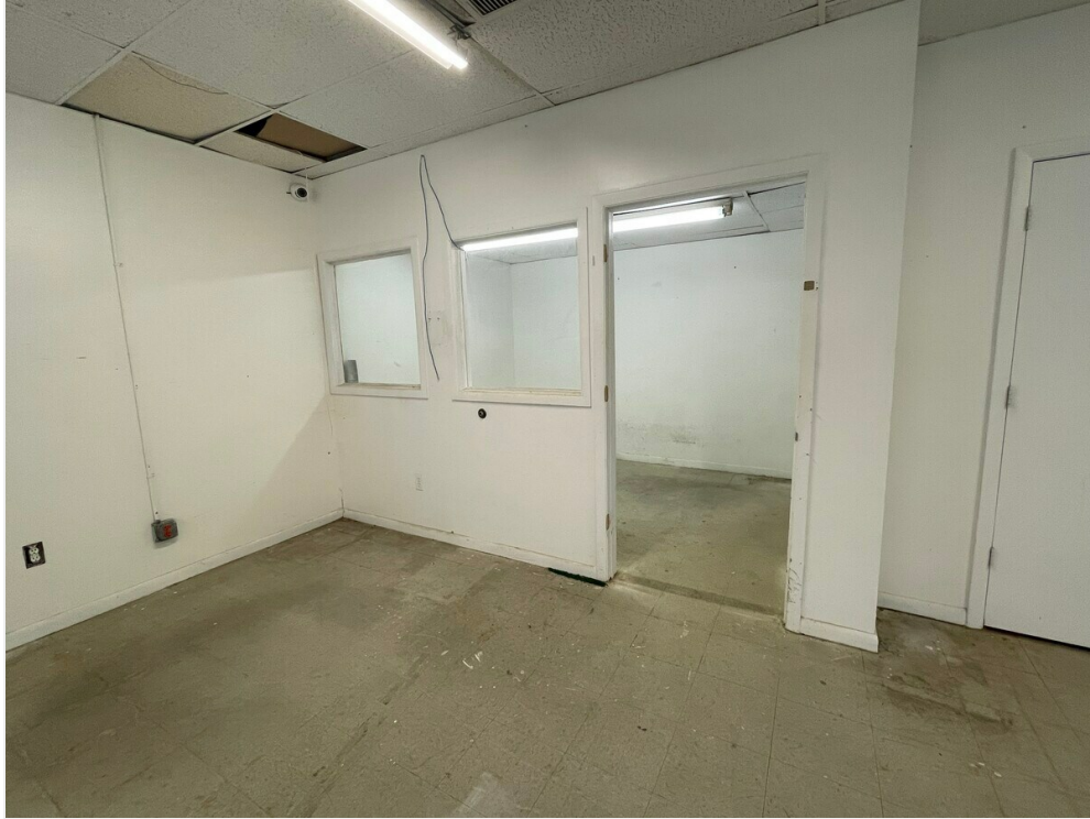
Private Office Space within Lobby/Office Area