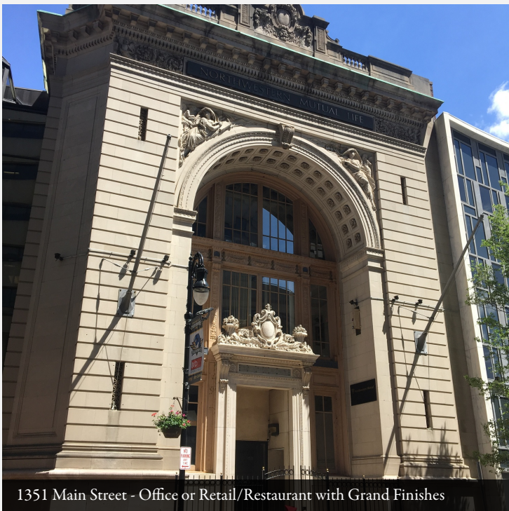
1351 Main Street - Office or Retail/Restaurant with Grand Finishes