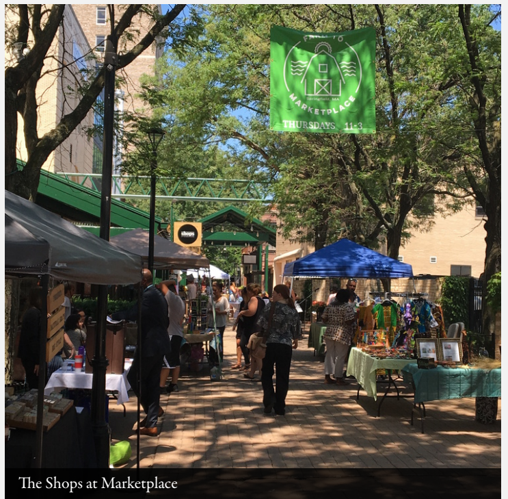
The Shops at Marketplace