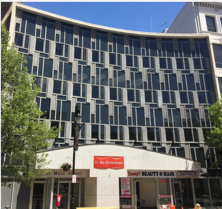
1341 Main St. - Street Retail with Upper Floor Office/ Market Rate Apts.