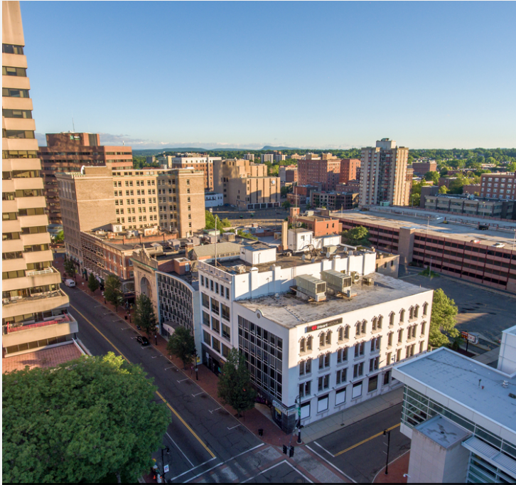
1331-1391 Main St. - An Entire Block in the Heart of Springfield's CBD