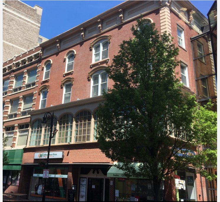
1365 Main St. - Street Retail with Upper Floor Office