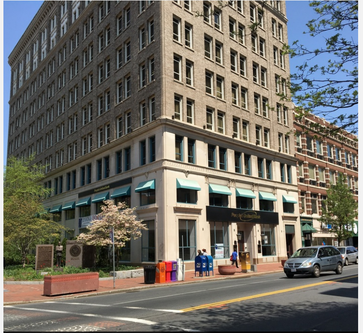
1391 Main St. - 10 Floor Office Tower with Street Retail/Visible Office