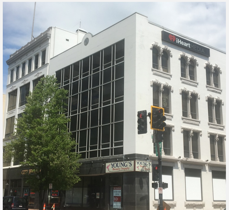
1331 Main St. - Street Retail with Upper Floor Office