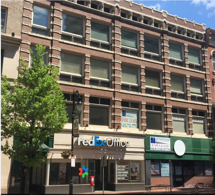
1383 Main St. - Street Retail with Restaurant Avail & Upper Floor Office/ Market Rate Apts.