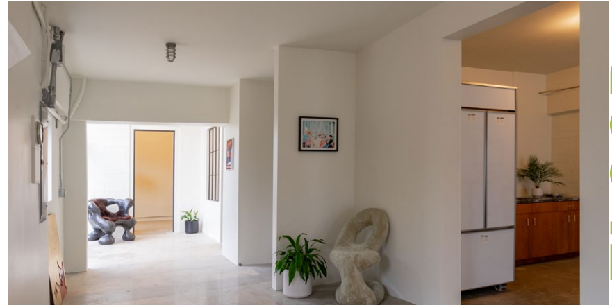
A— OPEN WORK SPACE