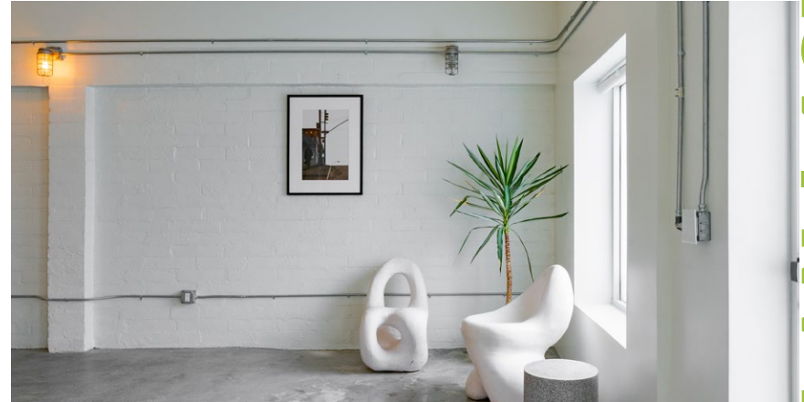
B— OPEN WORK SPACE