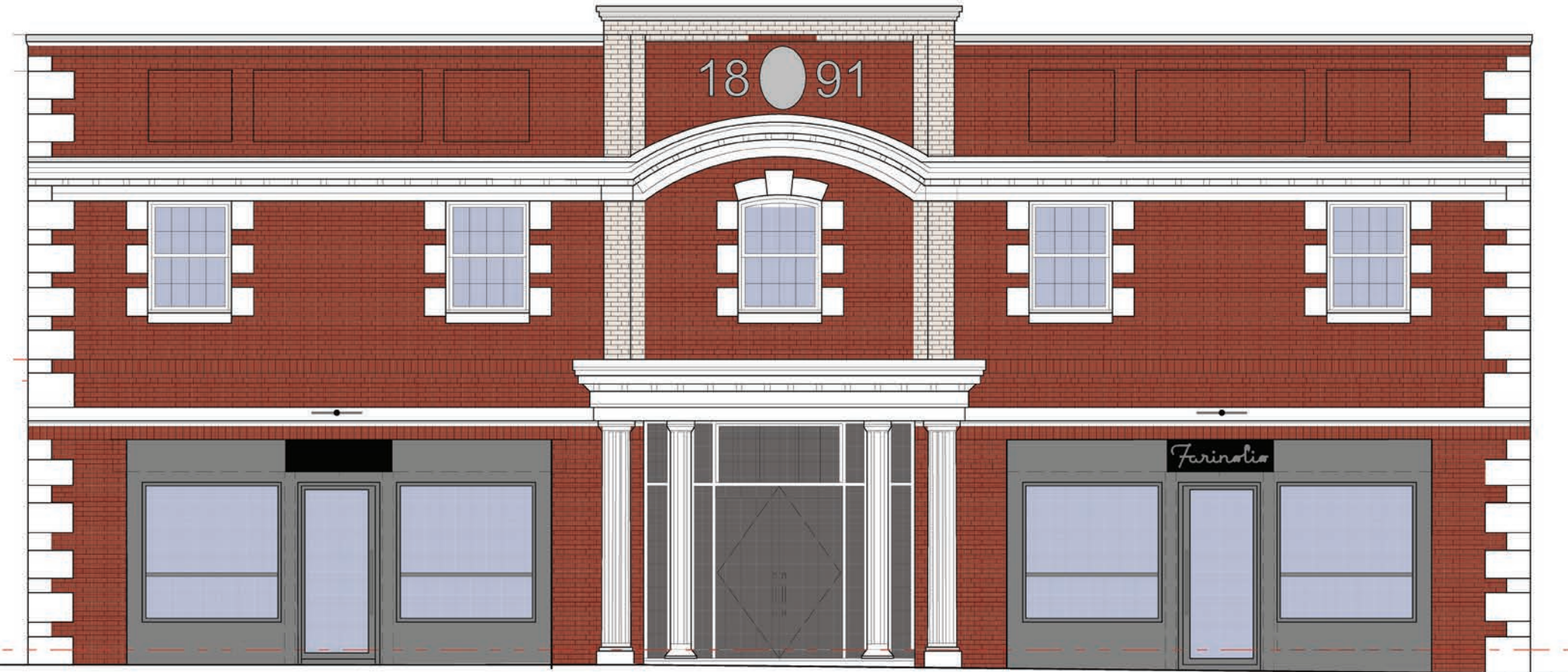
12 BANK STREET - FRONT ELEVATION