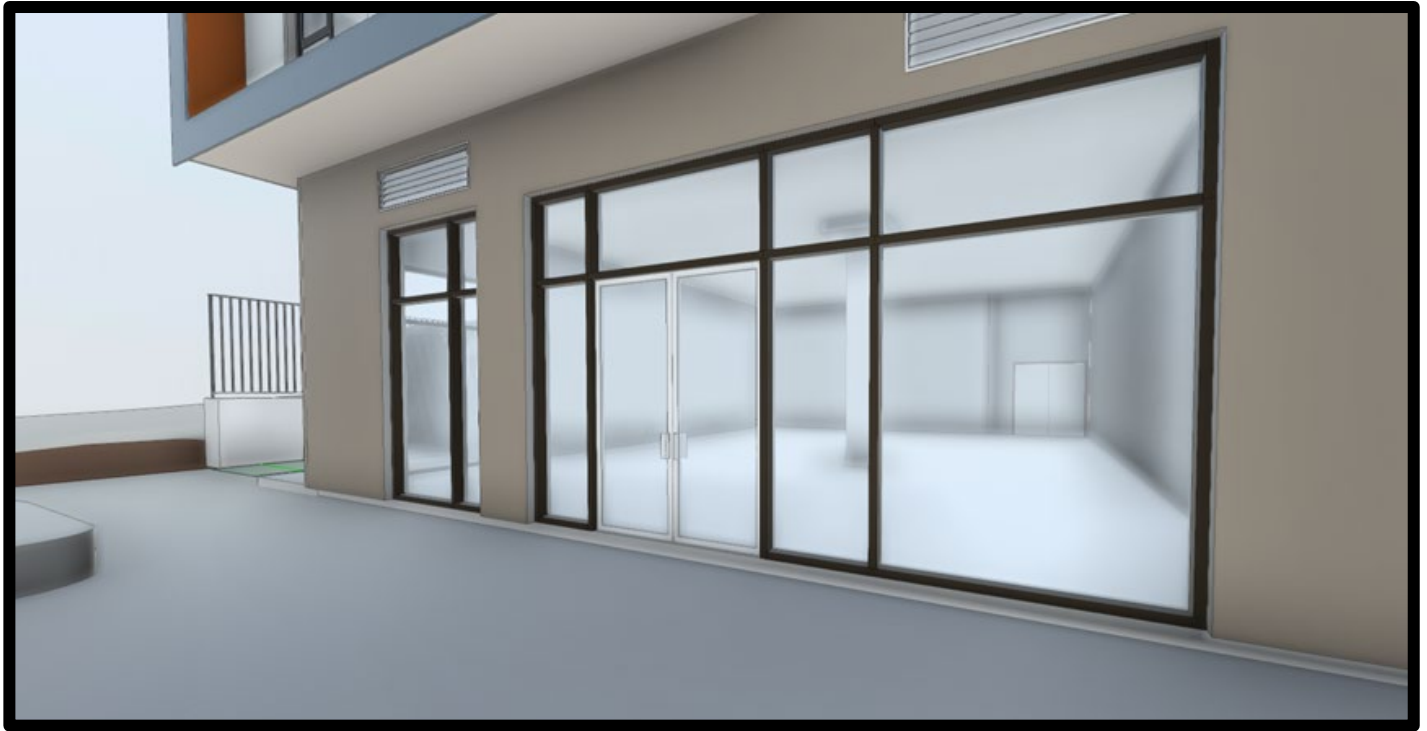
Mission Boulevard Location - Western Facing - Glass Frontage