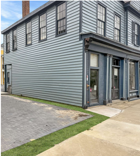
Sectioned Air Patio