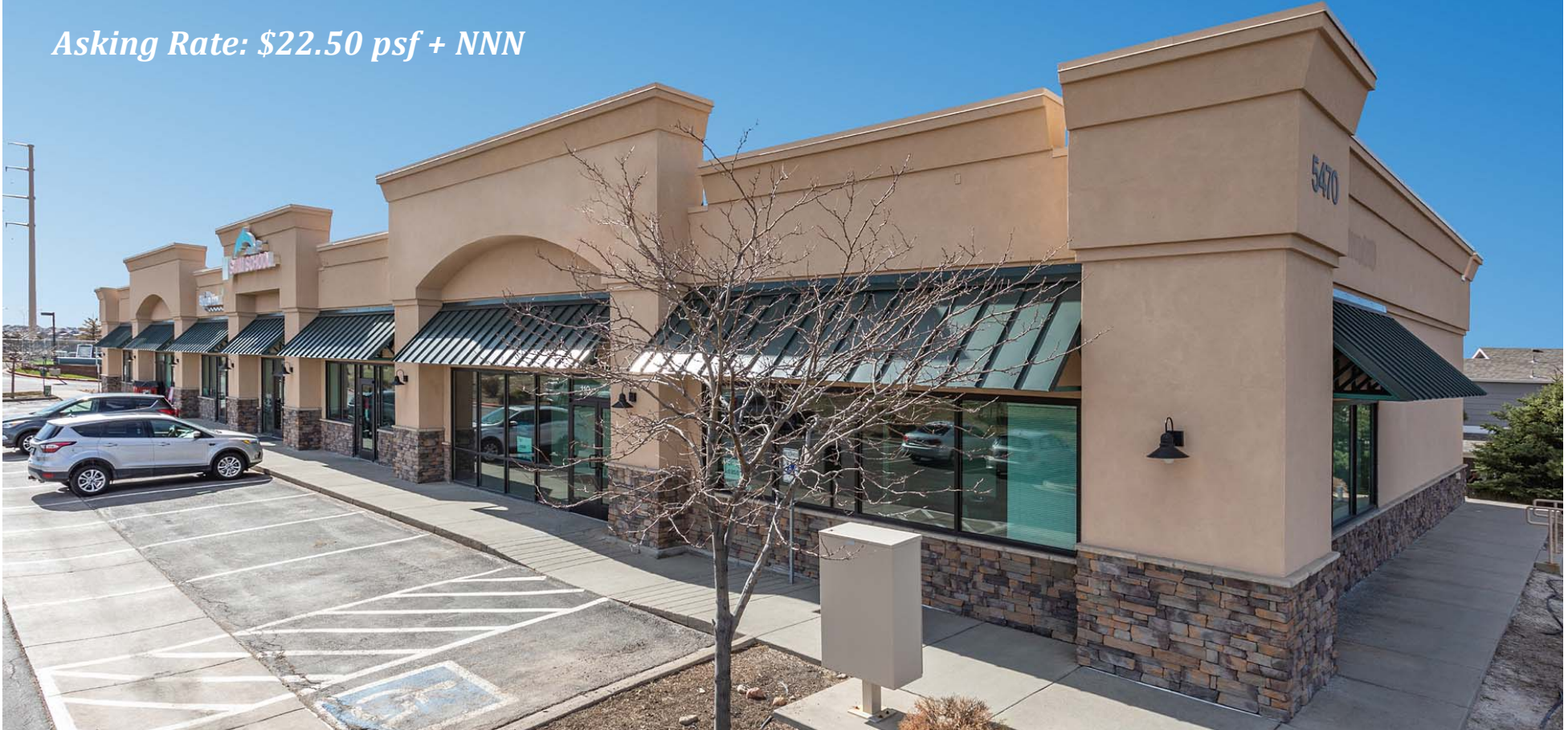
costar w/jbw modified image