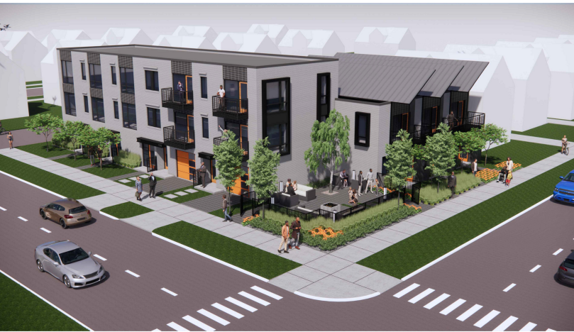
Exterior Rendering - Intersection Aerial View