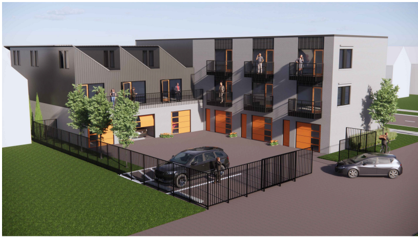
Exterior Rendering - Public Alley Perspective