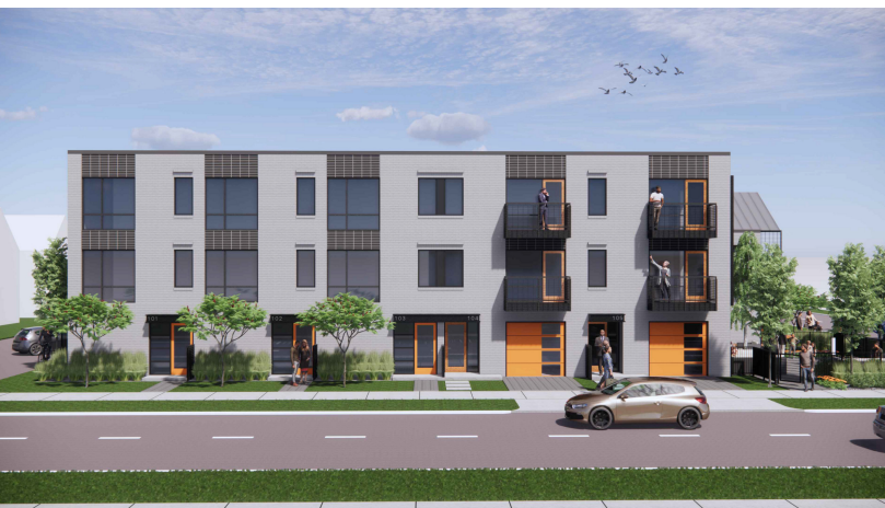
Exterior Rendering - Beaubien Street Elevation