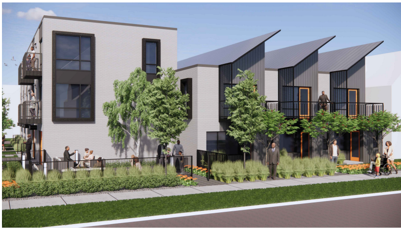
Exterior Rendering - Euclid Street Perspective