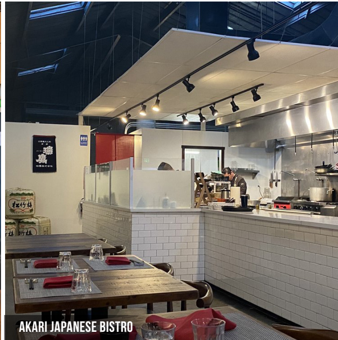
AKARI JAPANESE BISTRO