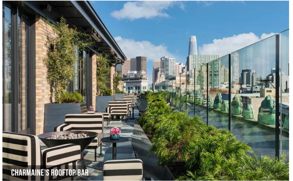
CHARMAINE'S ROOFTOP BAR