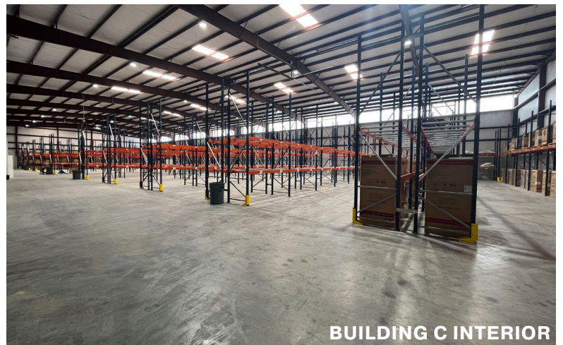
BUILDING C INTERIOR