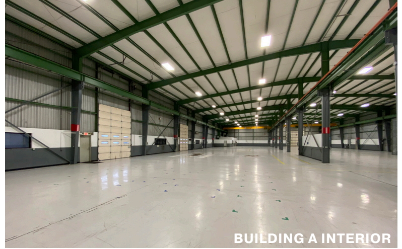
BUILDING A INTERIOR