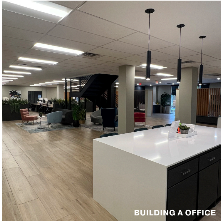
BUILDING A OFFICE