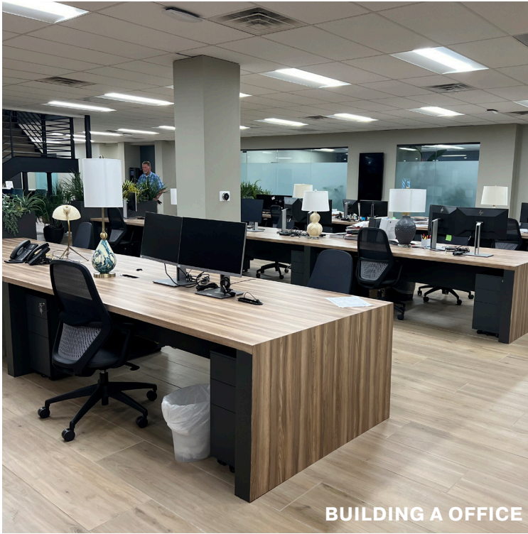
BUILDING A OFFICE