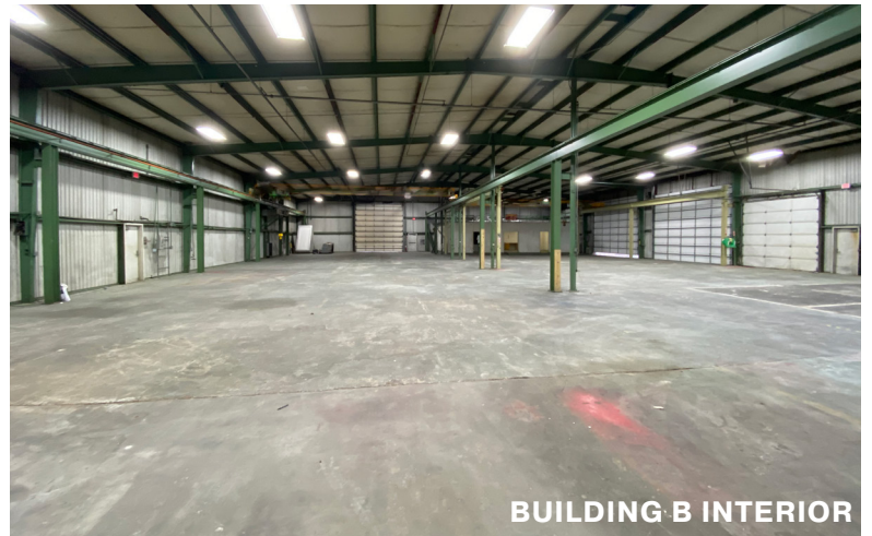
BUILDING B INTERIOR