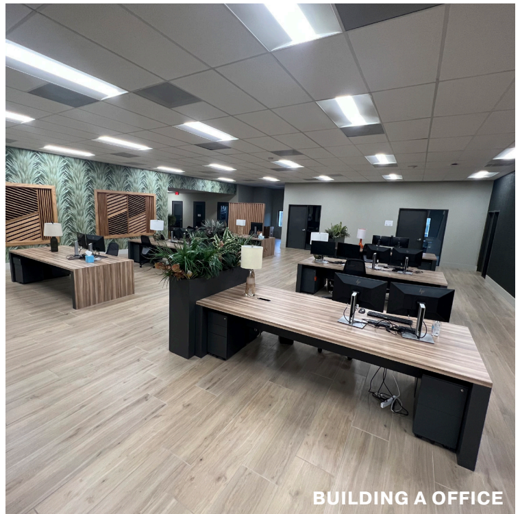
BUILDING A OFFICE