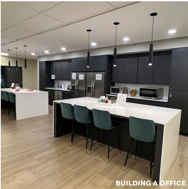
BUILDING A OFFICE