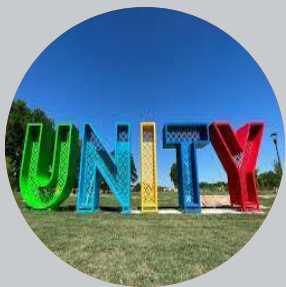
Steps from Unity Park