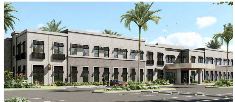
Medical office building currently under construction