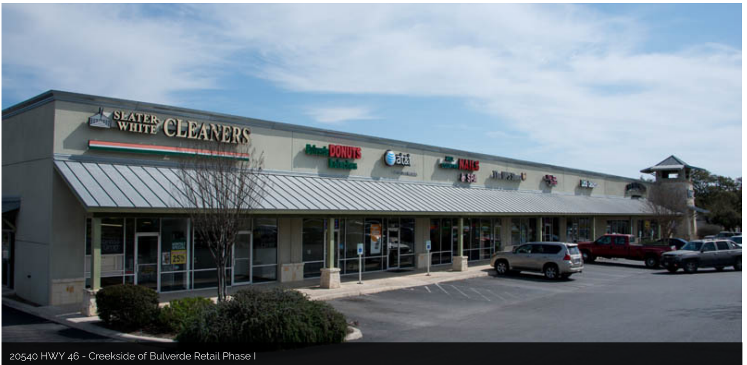
20540 HWY 46 - Creekside of Bulverde Retail Phase I