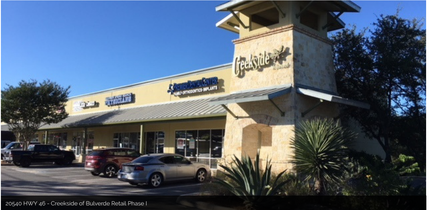
20540 HWY 46 - Creekside of Bulverde Retail Phase I