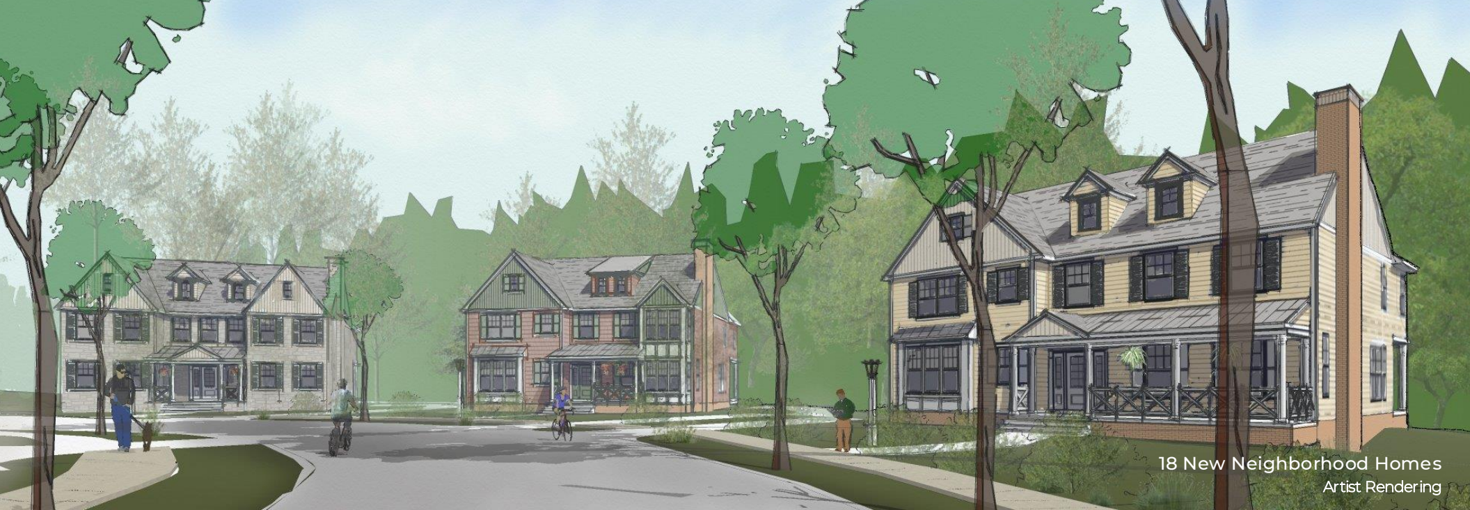
18 New Neighborhood Homes Artist Rendering