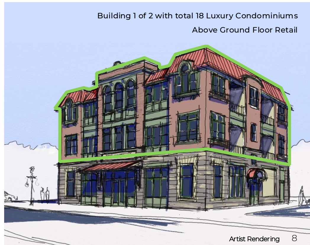
Building 1 of 2 with total 18 Luxury Condominiums Above Ground Floor Retail