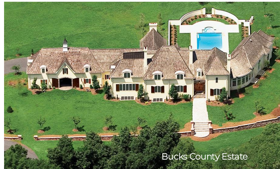
Bucks County Estate