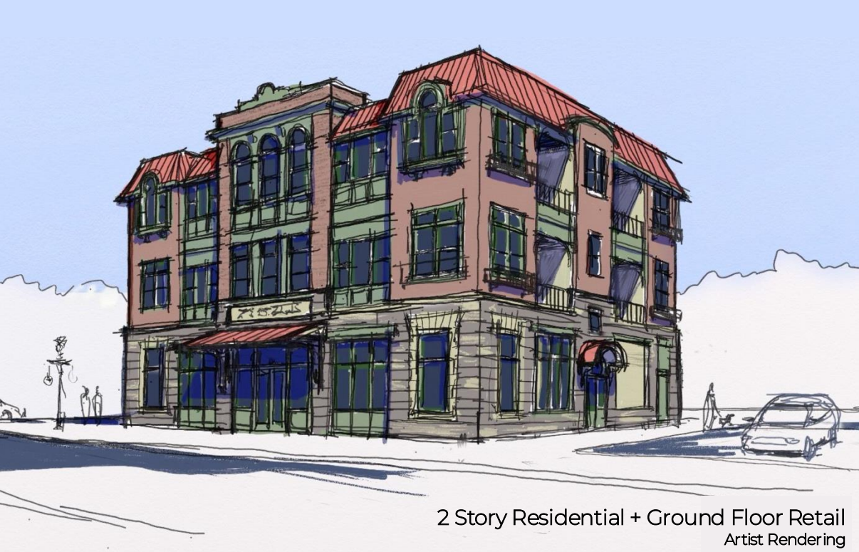
2 Story Residential + Ground Floor Retail Artist Rendering

The Location in eastern Bucks County will feature an infill redevelopment adjacent to one of the most successful retail destinations in the region, Peddler's Village. While retailers typically pull from a small radius, the adjacent attractions pull in more than 2 million visitors per year, making the area uniquely attractive to retailers. Housing demand continues to increase as it grows alongside neighboring communities of New Hope and Newtown Bucks County.