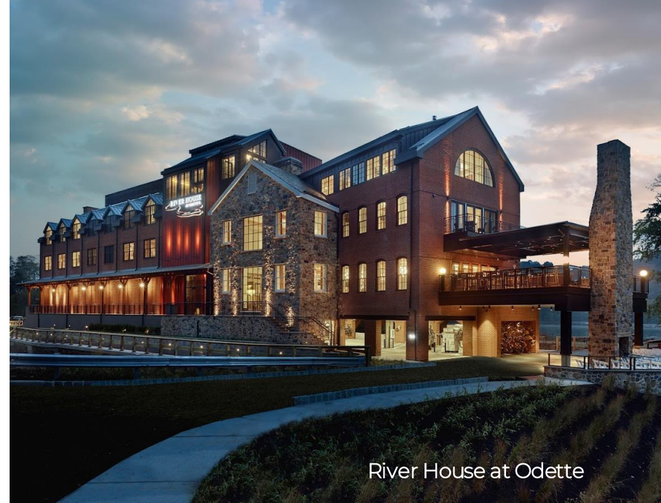
River House at Odette

Despite this, the towns have become a victim of their own success as a real estate boom is occurring. Home prices have skyrocketed alongside demand. Local tourism mirrors the real estate boom. On any given weekend, masses of visitors wander into local shops and galleries, and pack restaurants in the towns' commercial districts. Since 2020, three new luxury hotels have come on to the scene and another was extensively remodeled, with suites going for $400 to $1,000 a night, and investors have purchased downtown properties and transformed them into high-end short-term rentals.