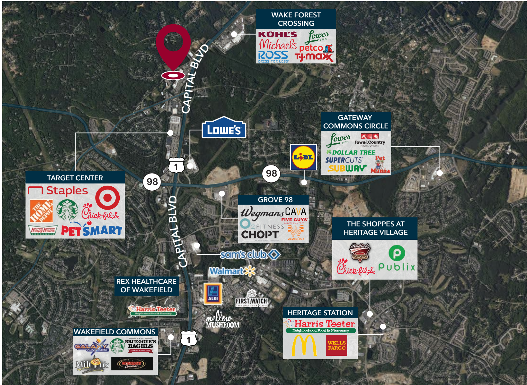
MARKET OF WAKE FOREST | WAKE FOREST, NC 27587