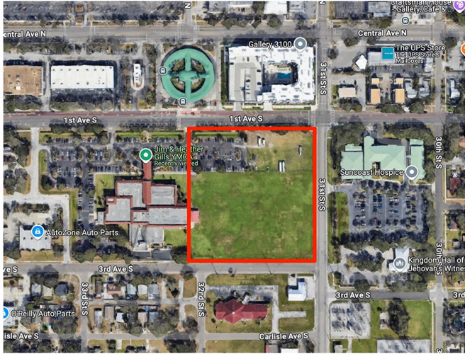
WHITNEY VILLAGE, CONTAINING A 325-UNIT APARTMENT COMMUNITY, 32,000 SQUARE FEET OF RETAIL, AND A 600-SPACE PARKING GARAGE, WILL BE CONSTRUCTED ON A 4.5-ACRE PROPERTY AT THE CORNER OF 1ST AVENUE SOUTH AND 31ST STREET | GOOGLE MAPS

South Carolina-based multifamily developer Greystar Real Estate Partners purchased the property from the neighboring YMCA in February for $12 million.