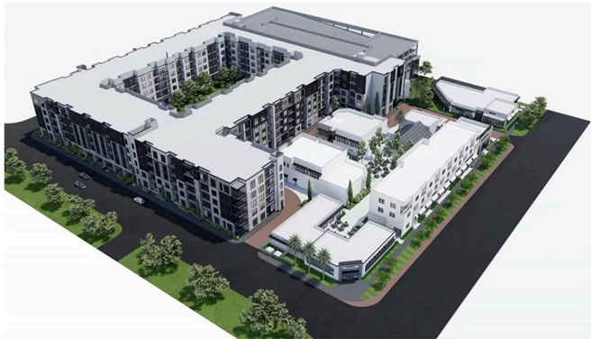
WHITNEY VILLAGE, A 325-UNIT APARTMENT COMMUNITY AND A 32,000-SQUARE-FOOT RETAIL VILLAGE HAS BEEN PROPOSED FOR THE CORNER OF 1ST AVENUE SOUTH AND 31ST STREET IN ST. PETE | FK ARCHITECTURE

"This neighborhood has evolved into one of St. Pete's most vibrant destinations, surrounded by walkable restaurants, breweries, and retail," continued King.