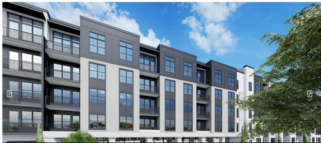
The Henry at Whitney Village FK Architecture

364 Shares f Share X Tweet in Share Email