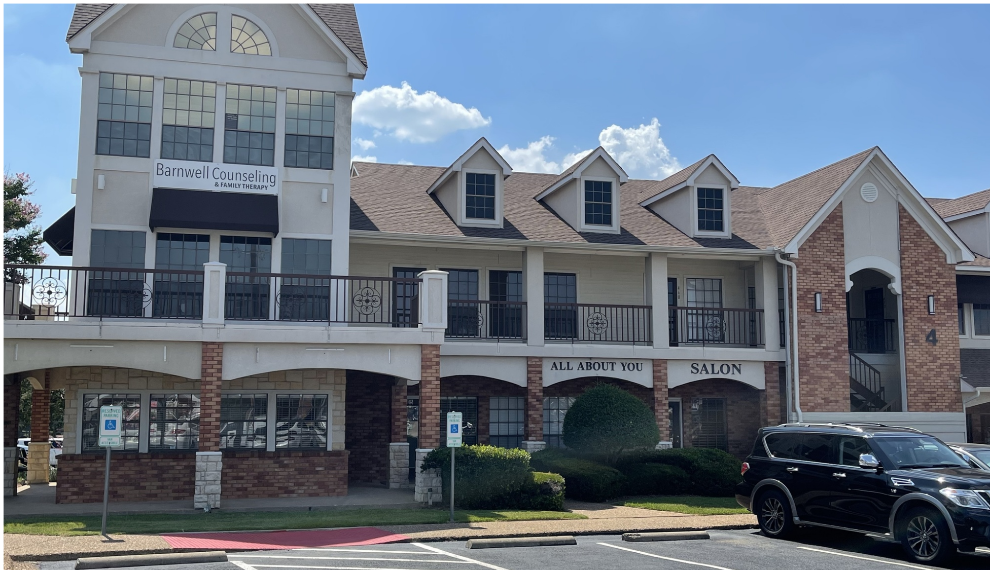
BUILDING 4 - VILLAGE CREEK | 2300 HIGHLAND VILLAGE RD HIGHLAND VILLAGE , TX 75077