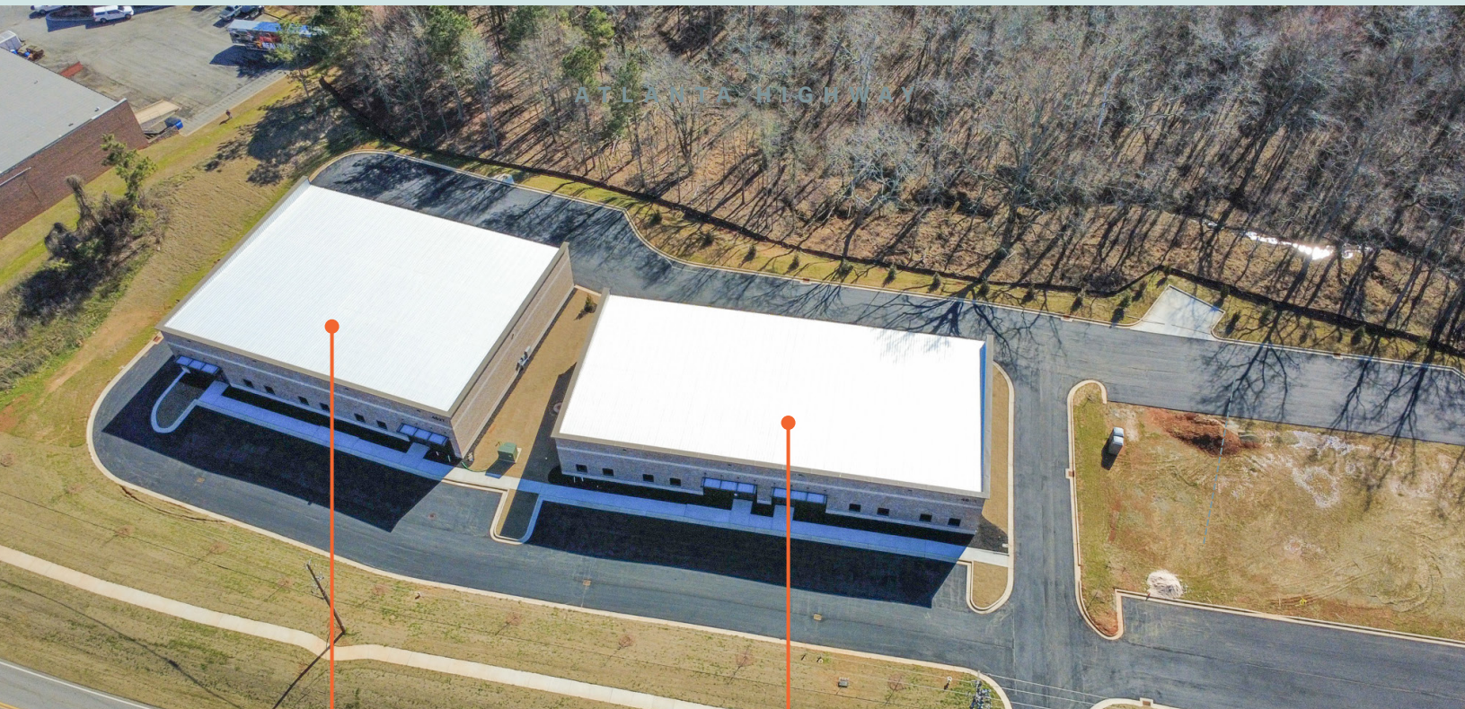
Bldg. 100 12,000 RSF Construction Complete