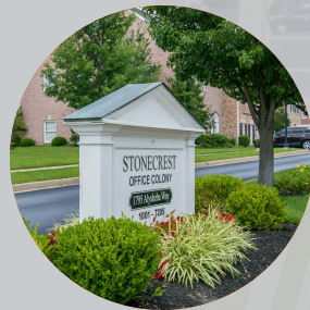
STONECREST OFFICE COLONY