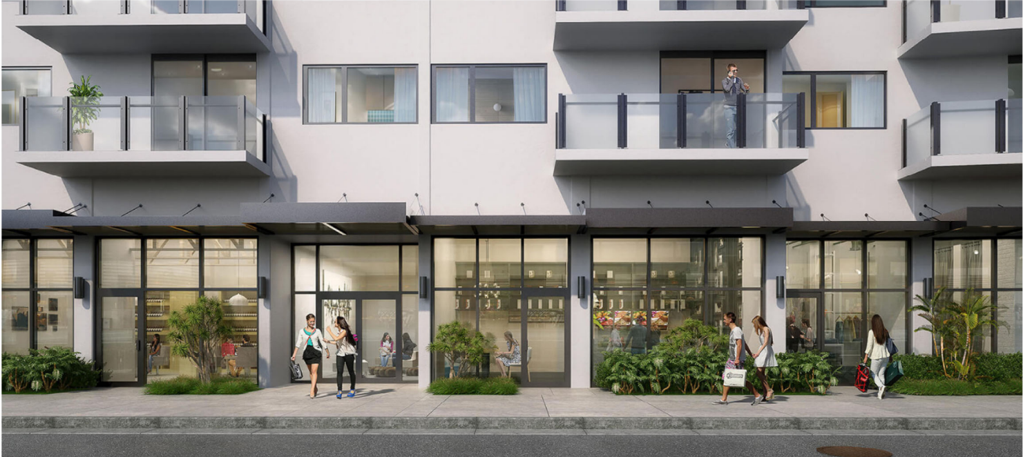
Artist Rendering

KAKA'AKO 615 Keawe Street KEAWE ST RETAIL SPACES AVAILABLE FOR LEASE projected March 2024 delivery