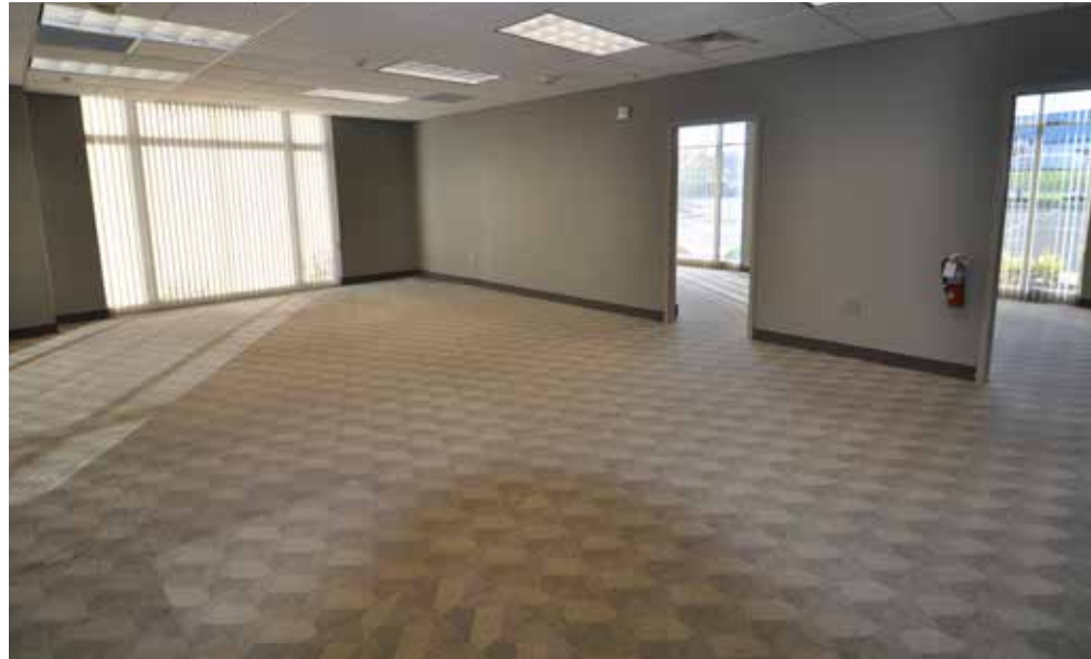
Suite 160 - 1st Floor - 1,829± RSF