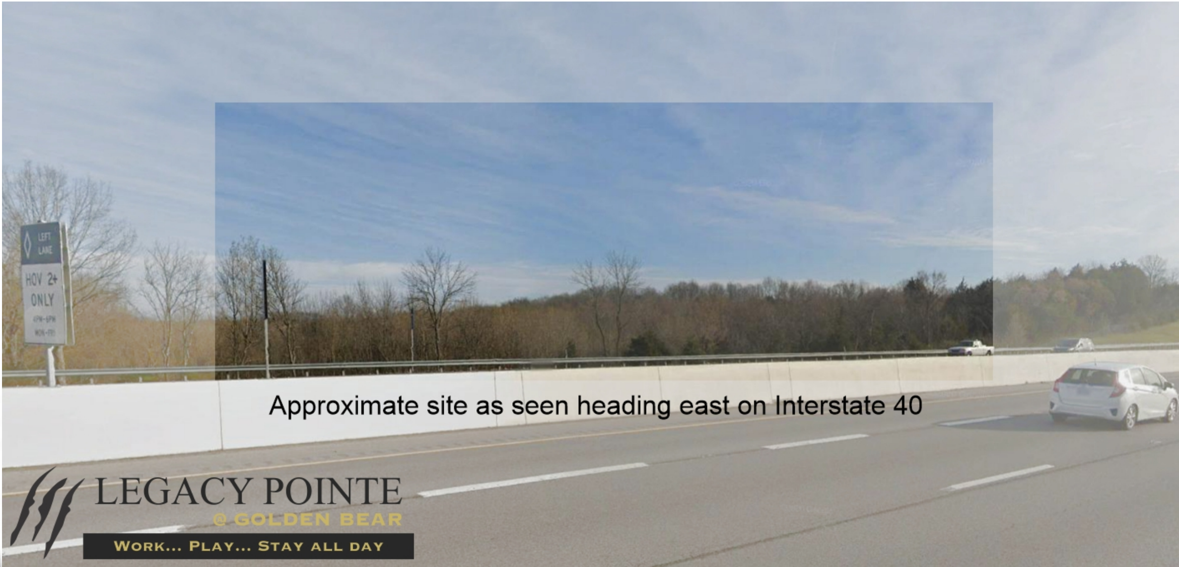
Approximate site as seen heading east on Interstate 40