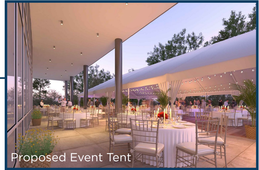
Proposed Event Tent