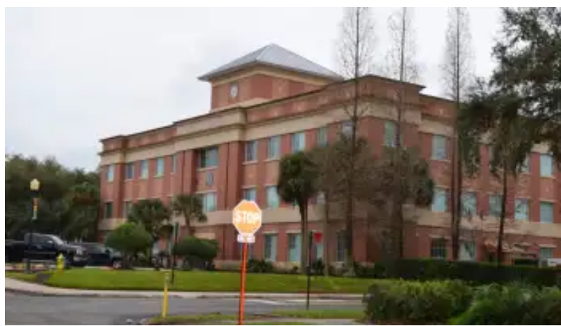
City's new budget approved September 26, 2019