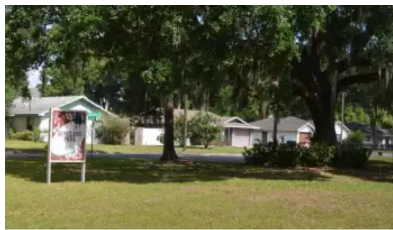
Two improvement projects on the way July 16, 2020