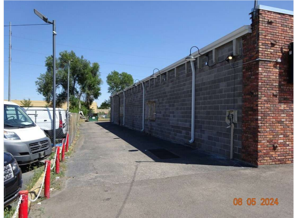
West Side of Building