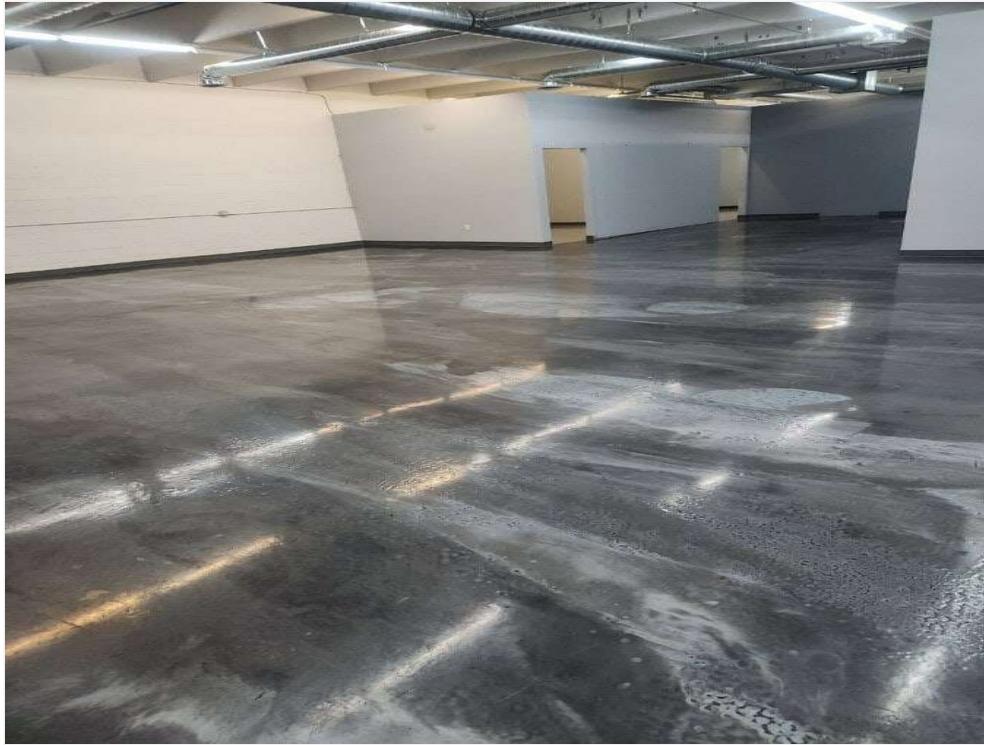
Open Area, Looking Back to Front