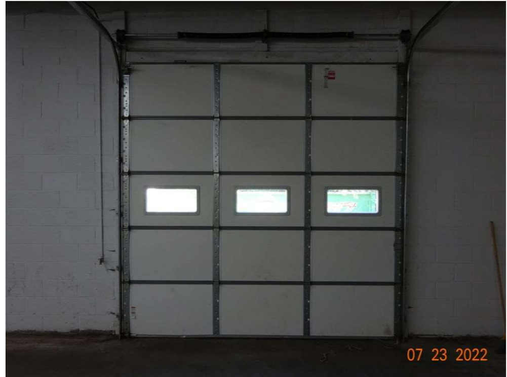
10' Door, Insulated