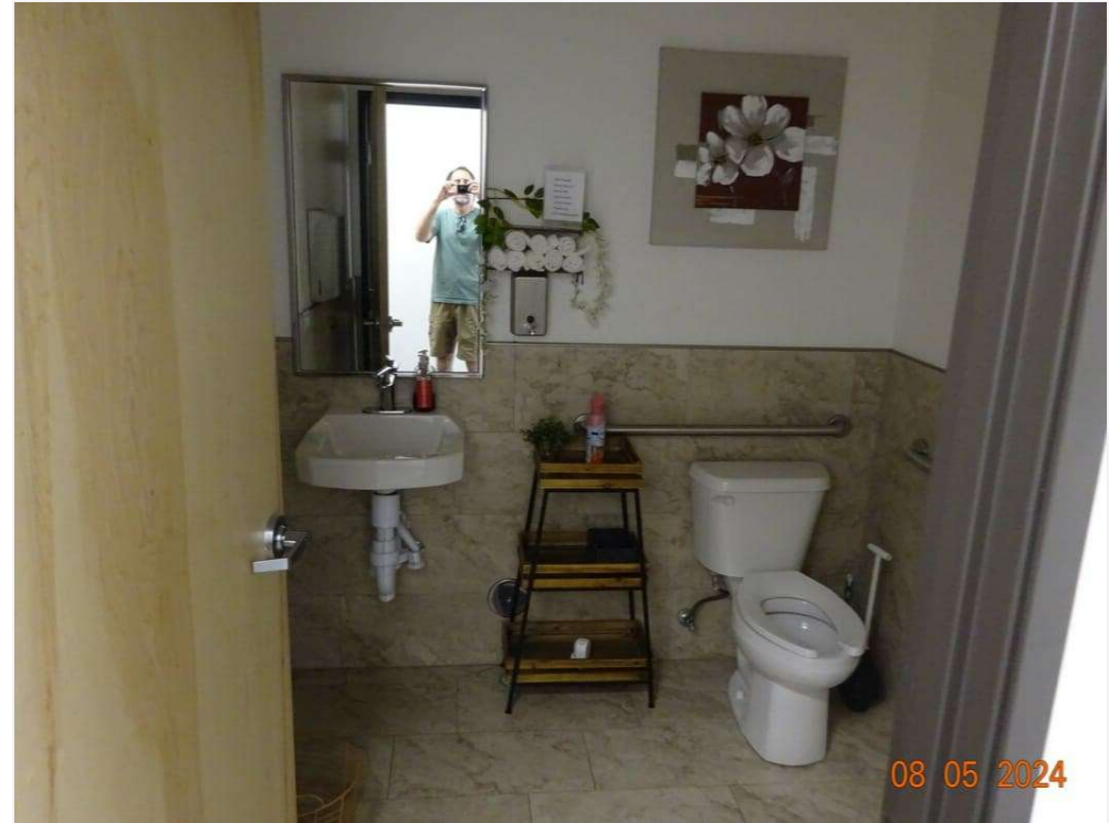
One of Two Bathrooms