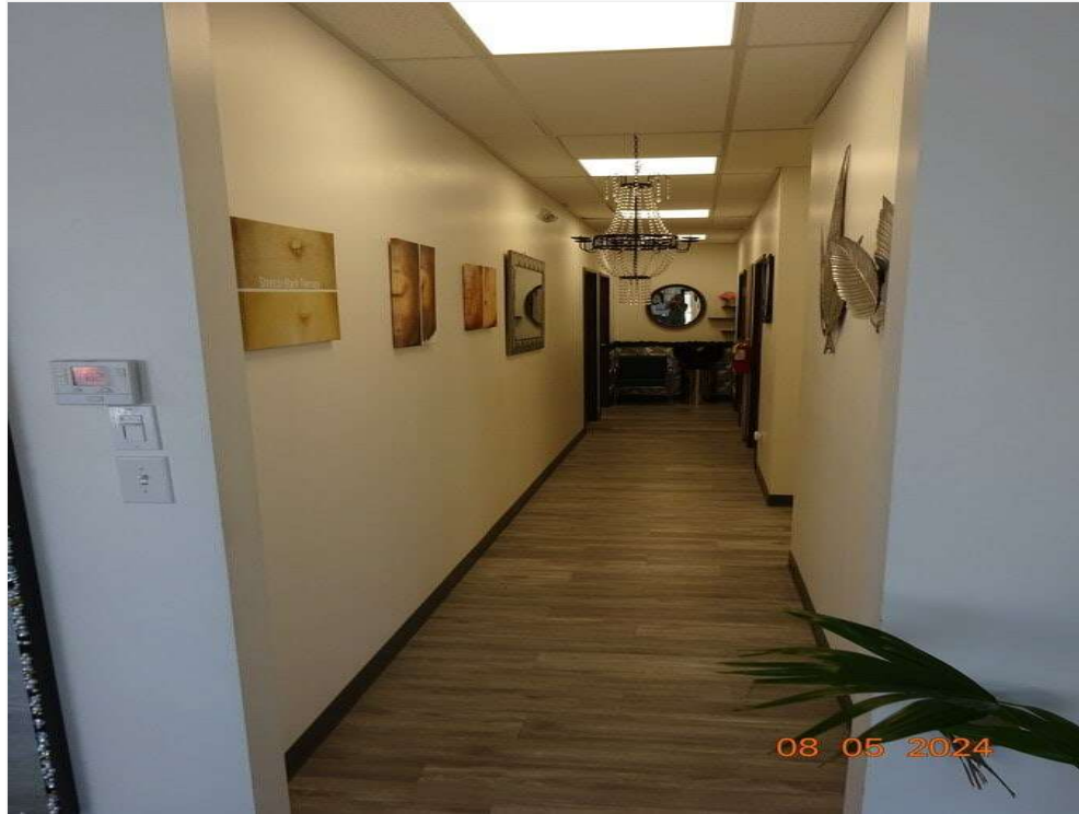
Hallway Front to Rear