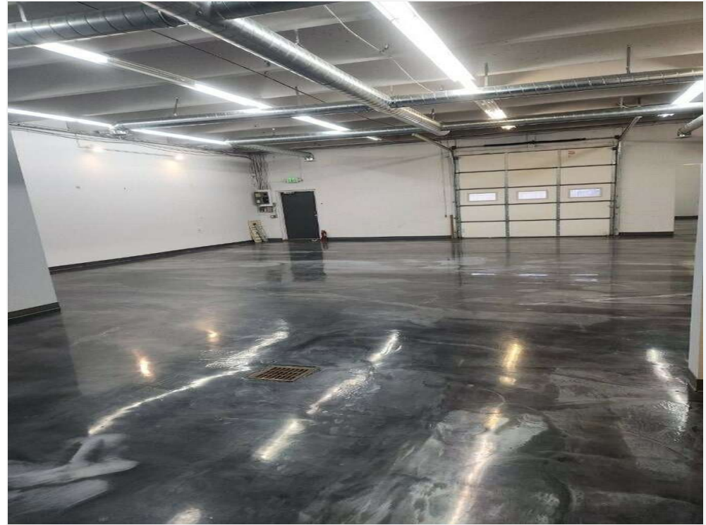
Open Area, Looking Front to Back