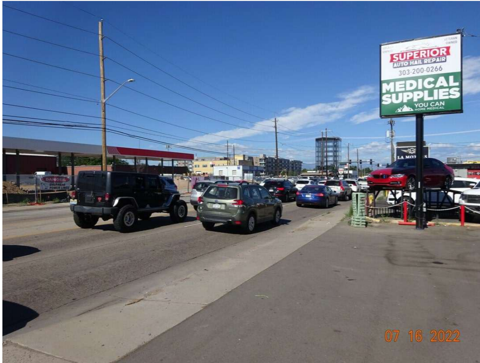
Evans Ave Looking West