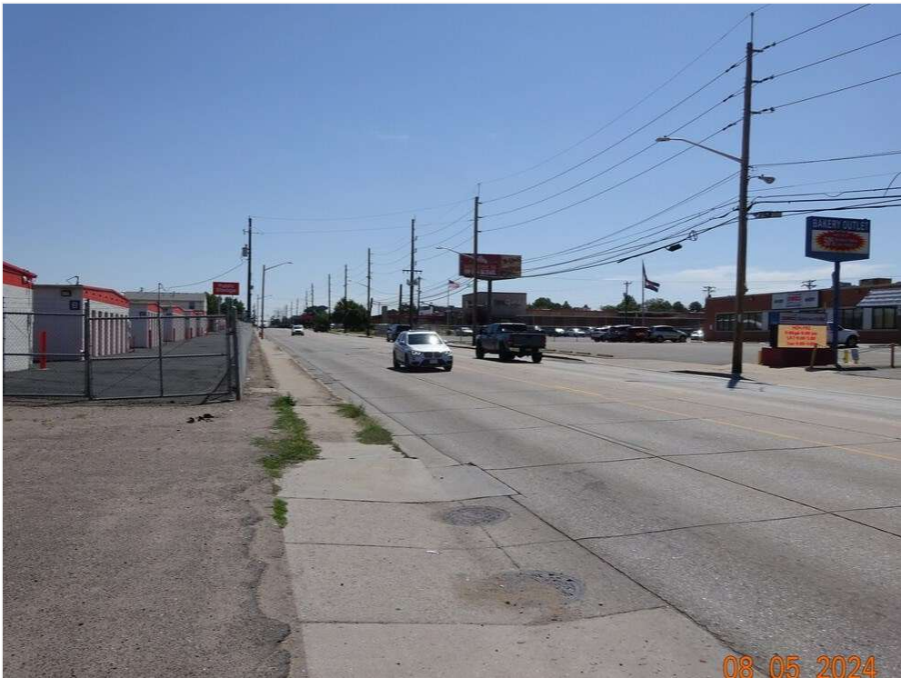
Evans Ave Looking East