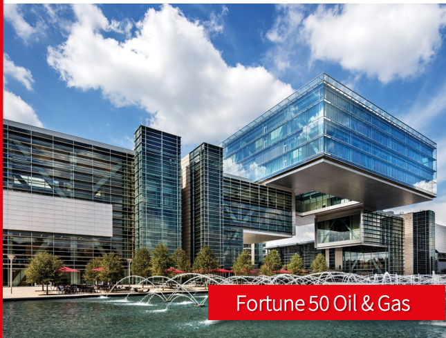
Fortune 50 Oil & Gas