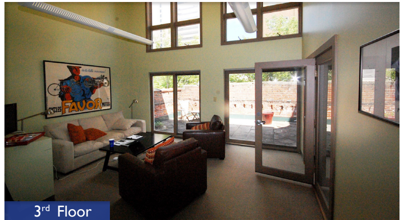
3 rd Floor