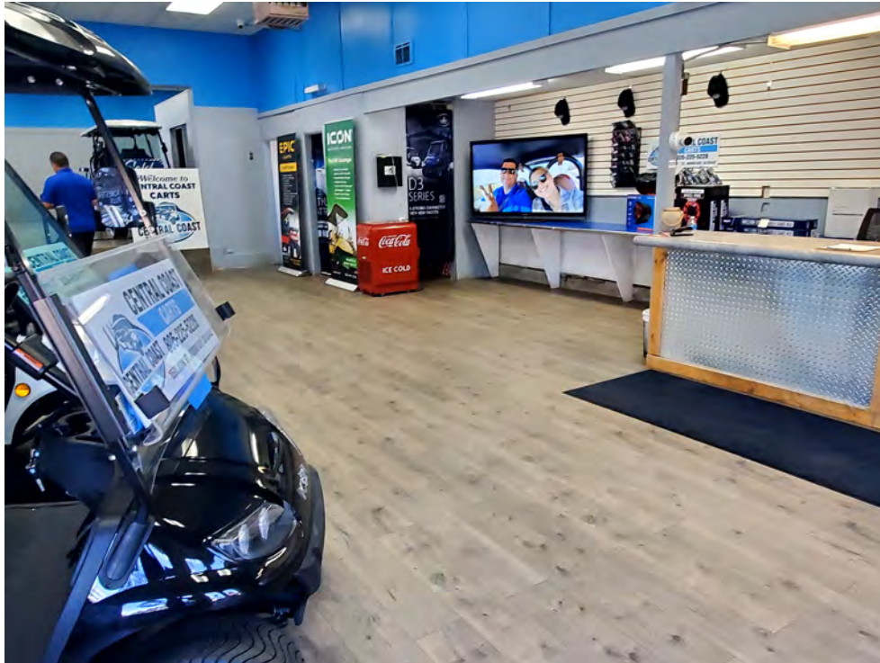
Sales counter with reception area

Beautiful build out in excellent condition