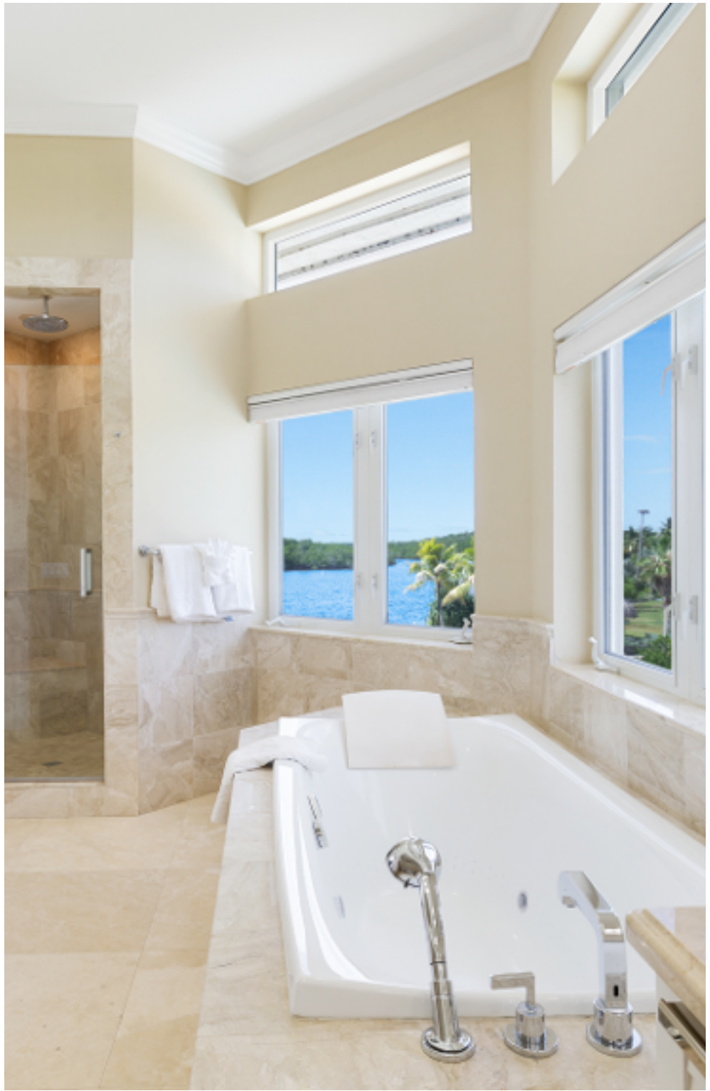
PRIMARY SUITE BATHROOM WITH SOAKING TUB AND VIEWS