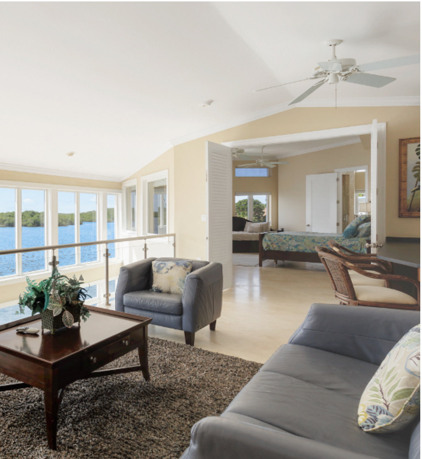
PRIMARY SUITE LANDING Relax on the landing off the primary suite while enjoying beautiful ocean views.